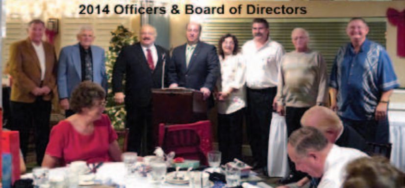
2014 Officers & Board of Directors