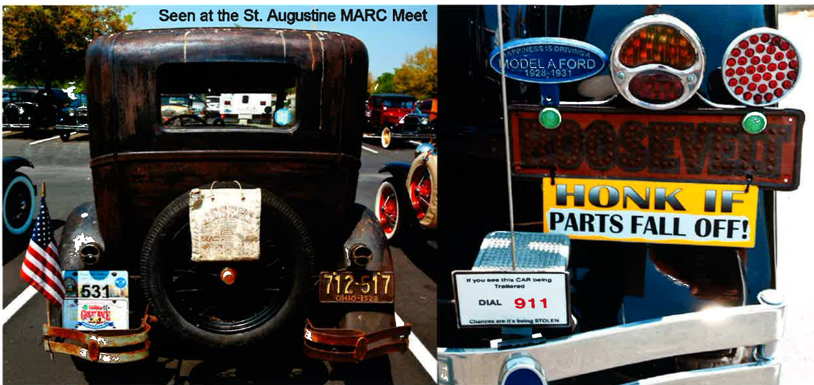
Seen at the St. Augustine MARC Meet