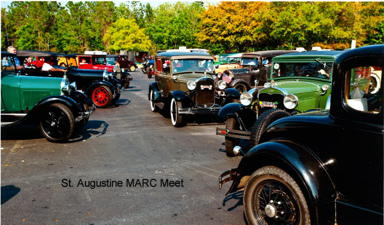
St. Augustine MARC Meet