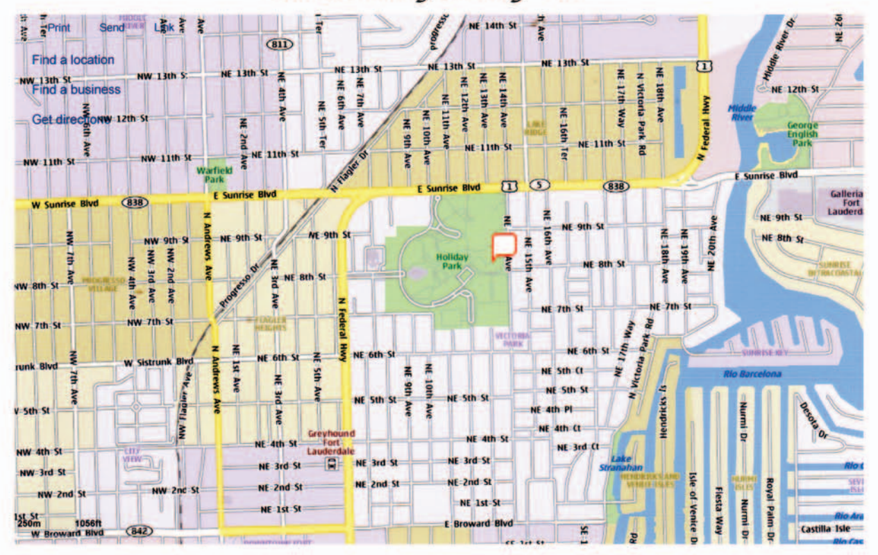
Map to Roberto Vichera's Garage 850 NE 41st Ct, Deerfield Beach

Map showing Holiday Park car show staging area for Great American Beach Bash Saturday May 26