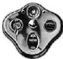
From the Presidents Dash