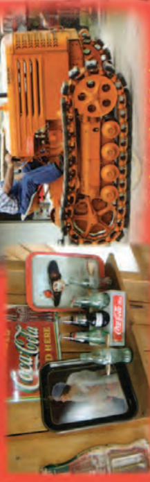
Antique Flea Market