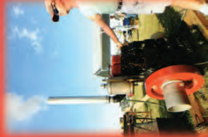
Tractors & Equipment