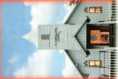
Operating Saw Mills, Barns, Garages