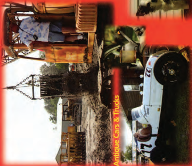
Antique Cars & Trucks

Antique Engine & Tractor Show February 20-21-22-23, 2013 Featuring International Tractors Spectator Admission - $7.00