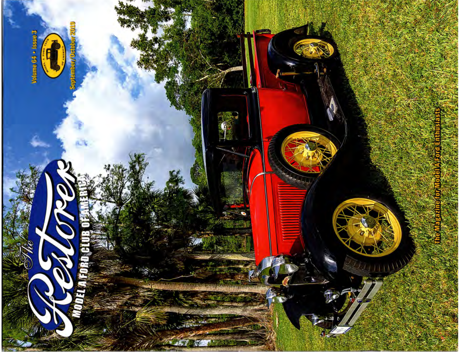
The Magazine for Model A Ford Enthusiasts