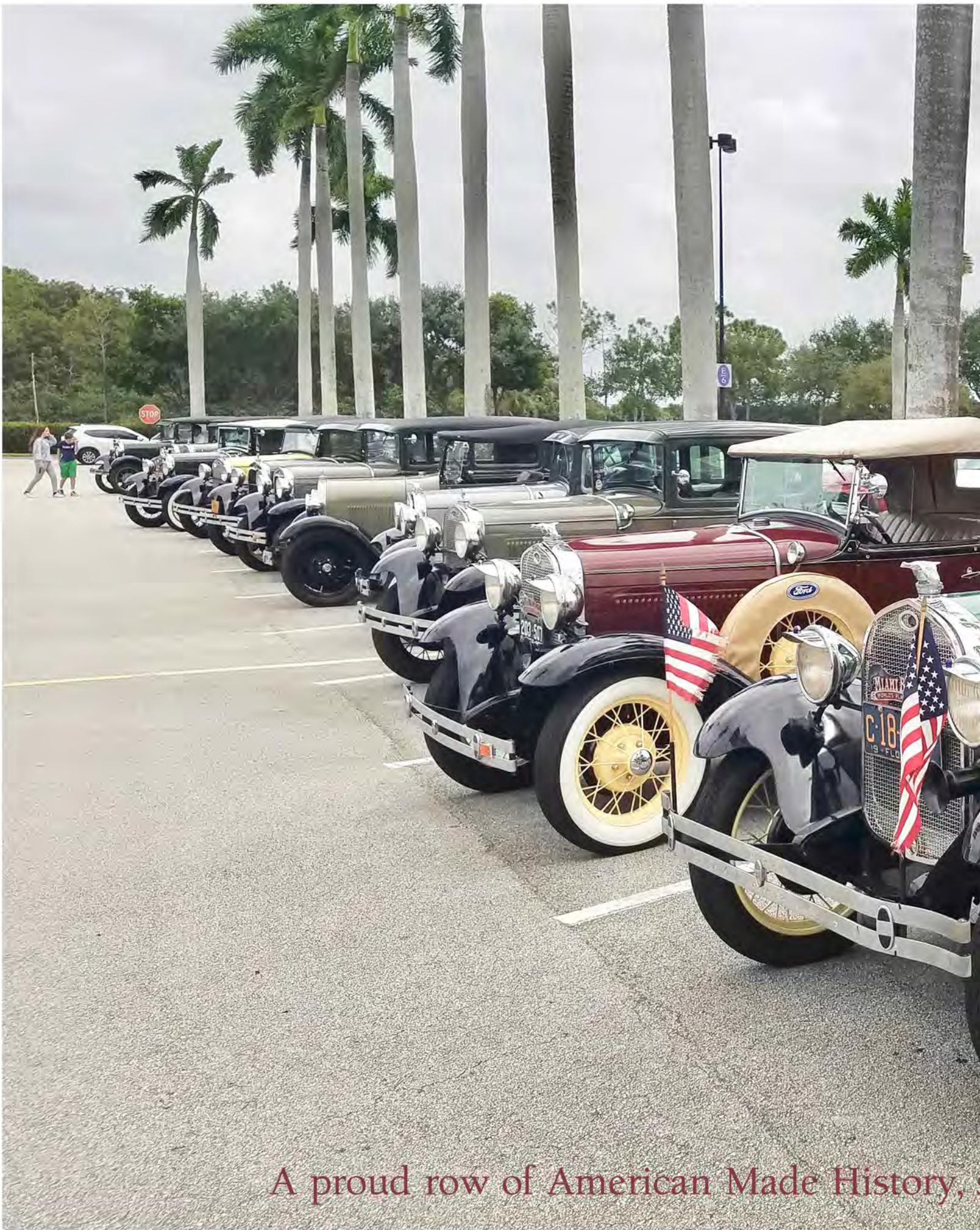
A proud row of American Made History, s