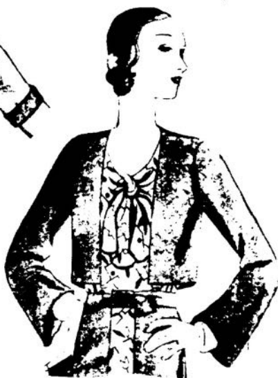
3837 - One of many varieties of Redingote Outfit.