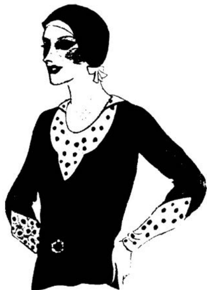
6467 - Eyelet collar.