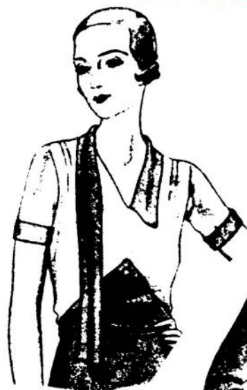
3823 - One-sided collar with falling scarf, lighter contrasting top, skirt panel reaching up into bodice for slimmer look.