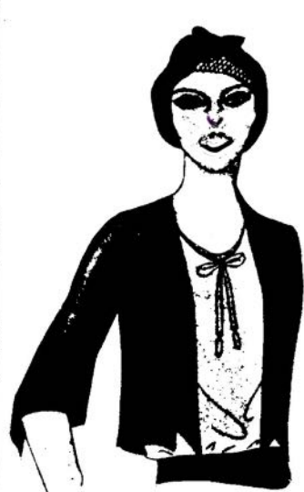
6459 - Eaton Jacket with longer sleeved blouse.