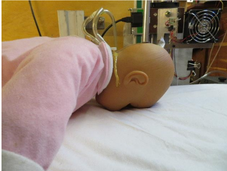
Figure 7 – Manikin Probe