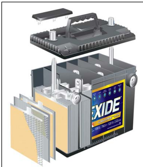
Figure 2. The Lead-Acid Battery Showing Internal Components