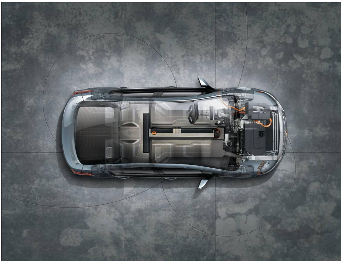
Figure B-1. Overview of the GM Volt