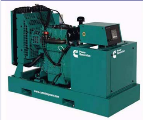
Figure 4: Reliability - With the Smart Grid, operators will aggregate and dispatch a network of backup generators for better peak management.

The seamless integration of DER will deliver substantial benefits.