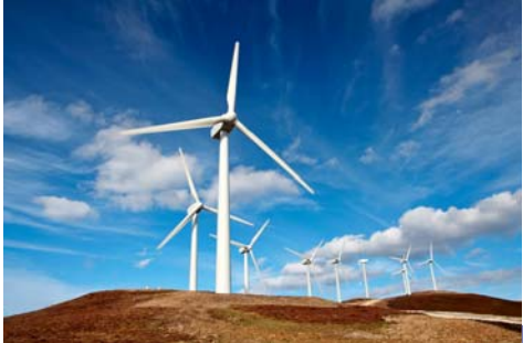
Figure 3: Renewable generation sources are an important option: the smart grid must enable the integration of intermittent resources such as wind turbines.

The future offers several growth pathways for DER, depending on how technologies and markets evolve. The Smart Grid will experience a significant growth of DER: