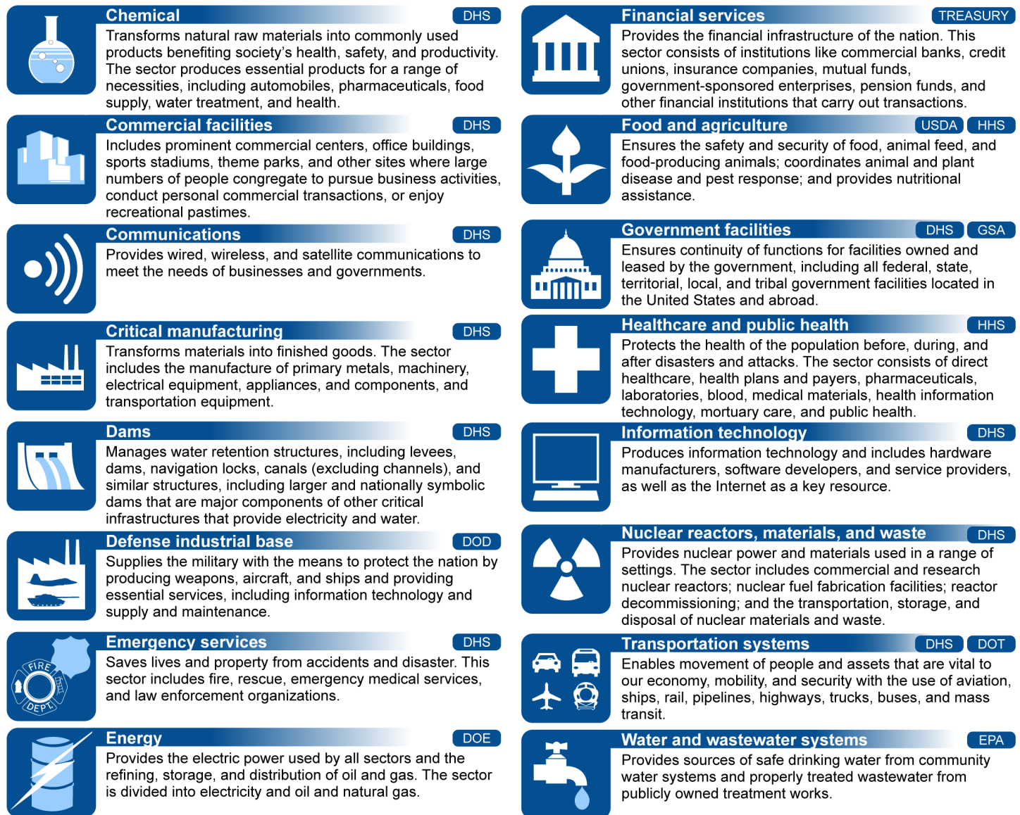
Figure 1: Sixteen Critical Infrastructure Sectors and the Related Sector-Specific Agencies

Departments of Agriculture (USDA), Defense (DOD), Energy (DOE), Health and Human Services (HHS), Homeland Security (DHS), Transportation (DOT), the Treasury; Environmental Protection Agency (EPA); and the General Services Administration (GSA)