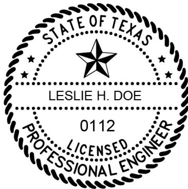
Figure: 22 TAC §137.31(c)