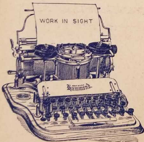
The Leading Typewriter of the World.