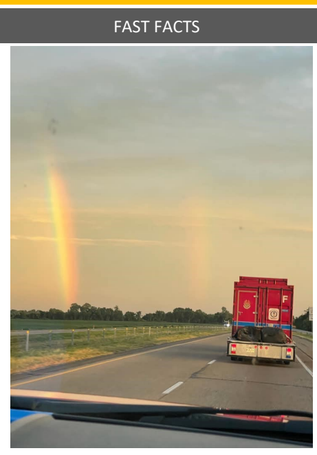
ILTF-1 on their way to assist with