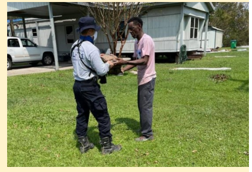
nificant role with the deployment effort. Strong work!

Thanks to the many individuals and agencies involved with the planning efforts to deploy and support the IL-TF 1 and the Fire Engine Strike Team responses. Special thanks to the MABAS AHOST Committee for their support in planning and the ongoing support of the fire engine strike team deployment, including that of the committee members that served as the MABAS Strike team Leaders for the deployment. RED Center also played a sig-