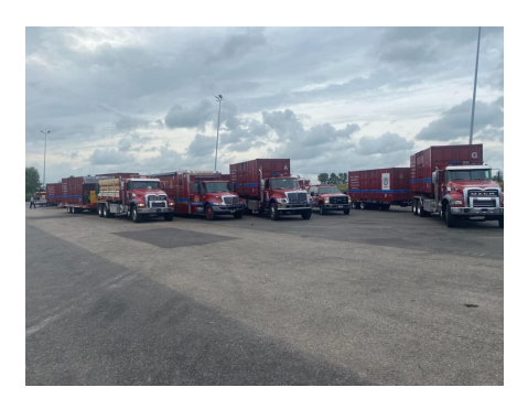
Apparatus staging to assist with Hurricane IDA.

capabilities be sustained without a known funding source?