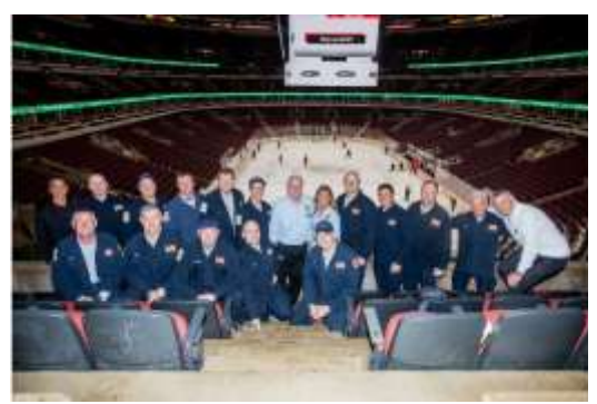
MABAS was invited to the Black Hawks Training Session