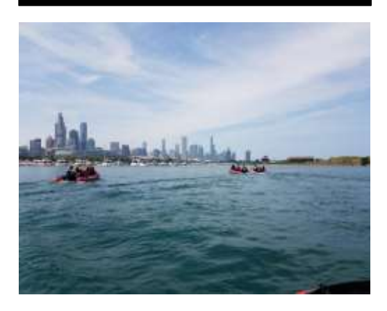
Training with Chicago in Chicago!!