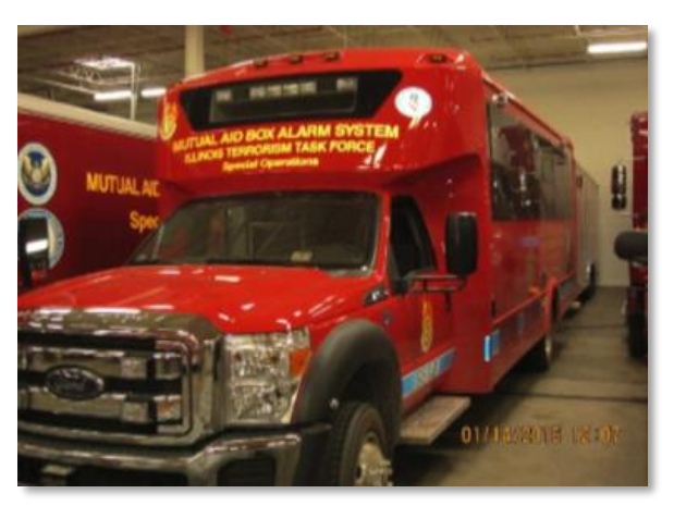
US&R personnel transportation 24 passenger