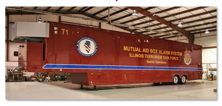
Tent City - 3

Semi-trailer with 10 Western Shelter 19' X 35' tents, HVAC, cots and accessories. Built in generator to power all ten tents. Accommodates 200 responders.