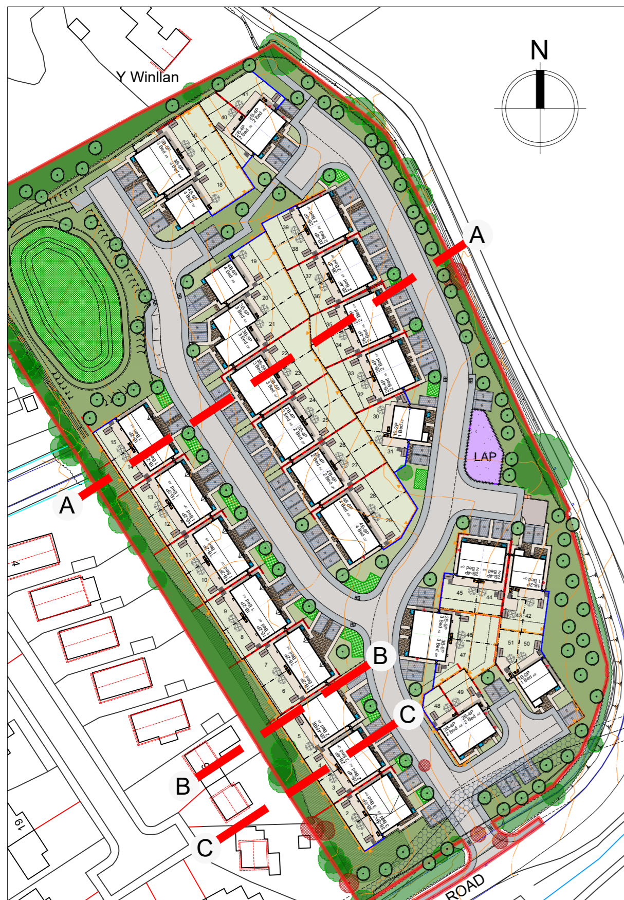
SITE PLAN 1:1000