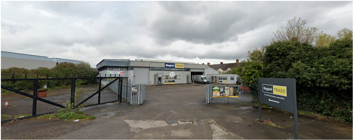
View from East Tyndall Street