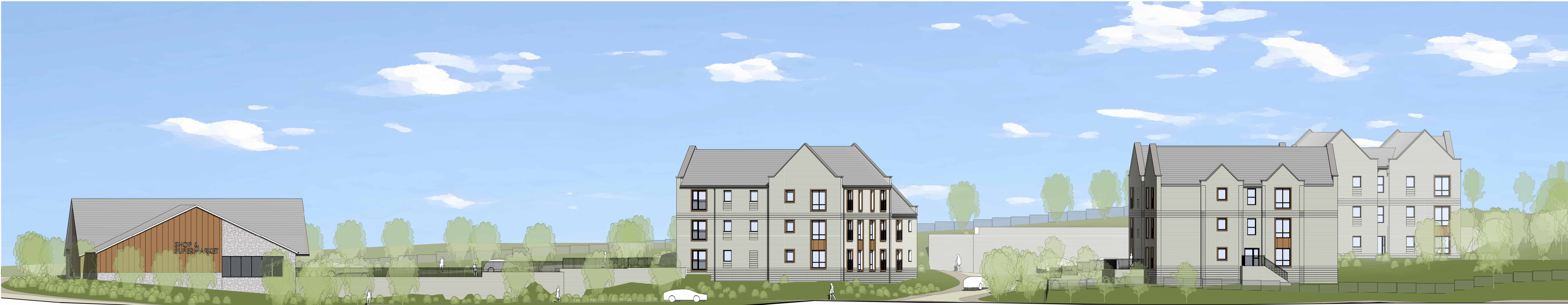
Section B - East 1 : 200