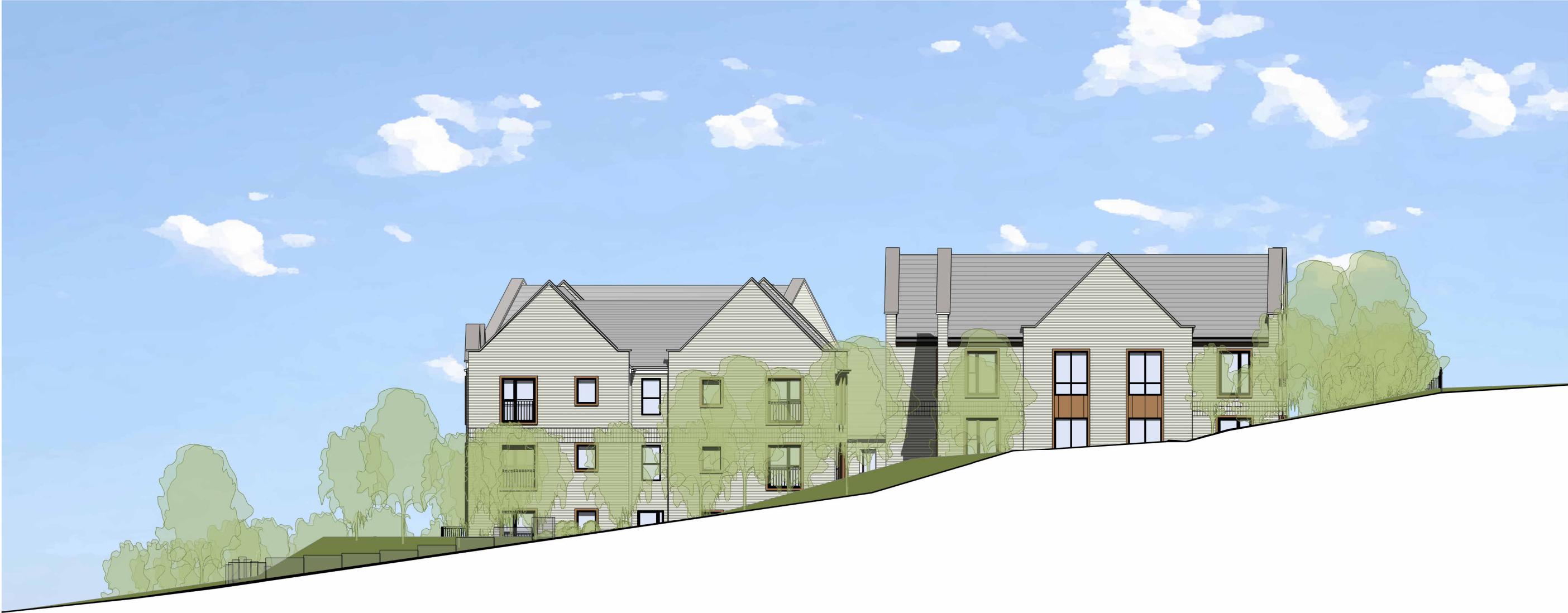
Section C - North 1 : 200

A1 Original sheet size Note: This Drawing is copyright. Its use or reproduction is subject to permission from Spring Design Consultancy Limited. All rights are reserved until invoices are paid in full. Contact SDC regarding terms & conditions. Check printed scale. responsibility is not accepted for reproduction of digital media or measuring from this document. Only figured dimensions to be used for construction. No responsibility will be taken for any design used for construction prior to receipt of relevant approvals. Report doubts/discrepancies to project Architect.