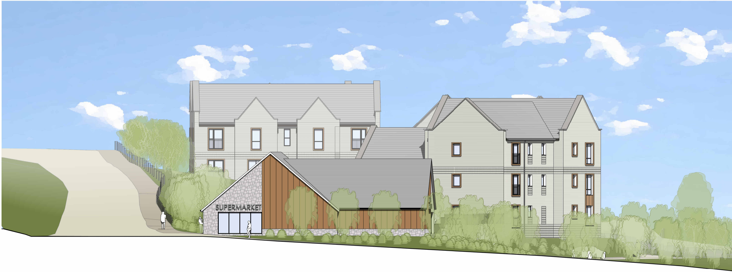
Section A - South 1 : 200