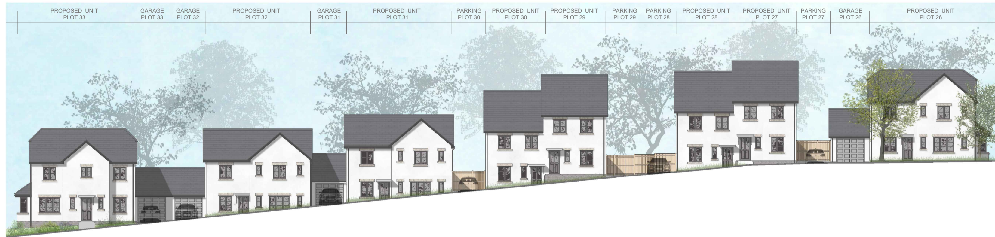
Datum 72000 ELEVATION B-B