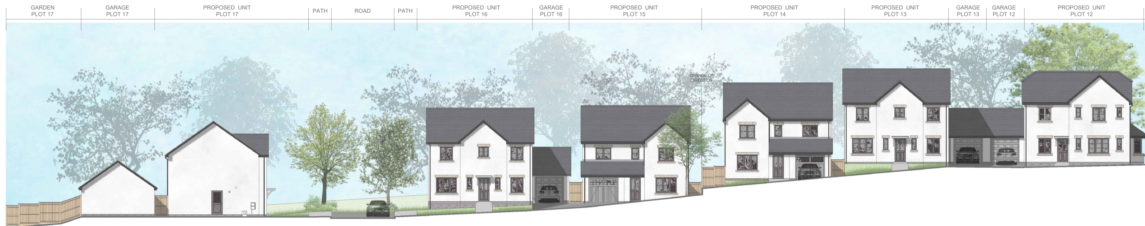
Datum 72000 ELEVATION C-C