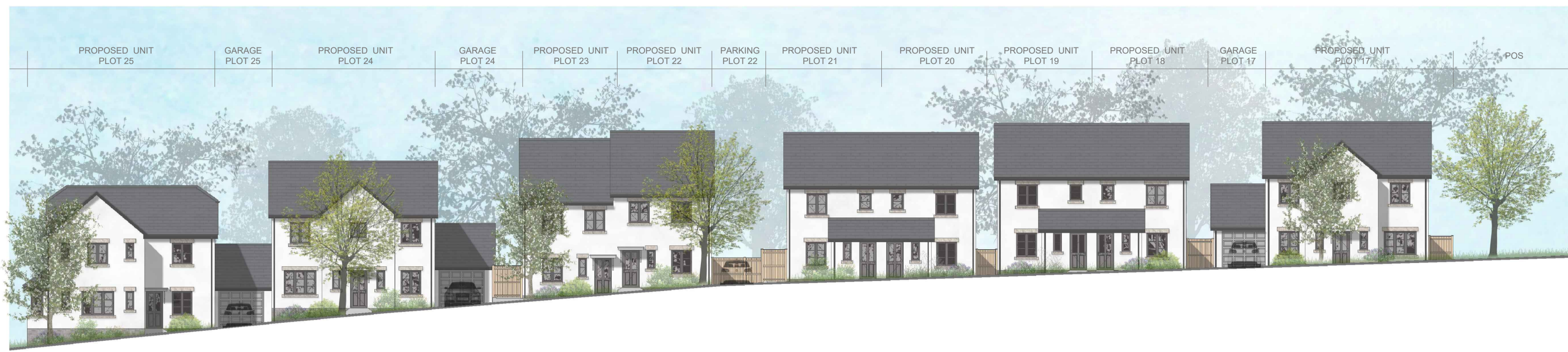
Datum 78000 ELEVATION A-A