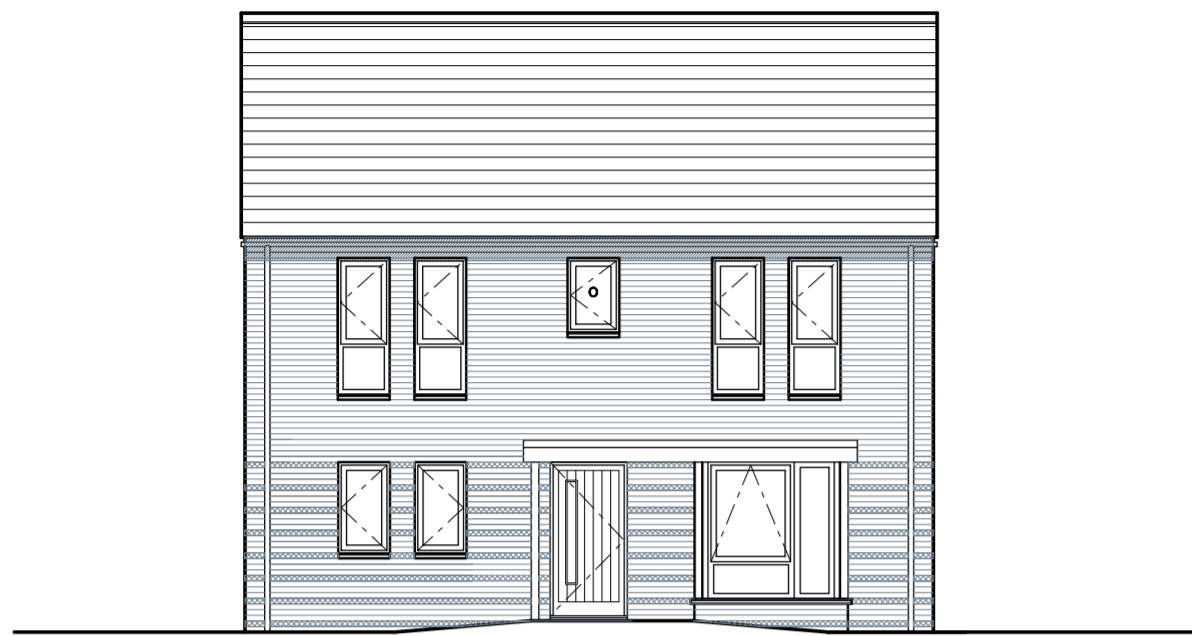
Front Elevation (1:100)