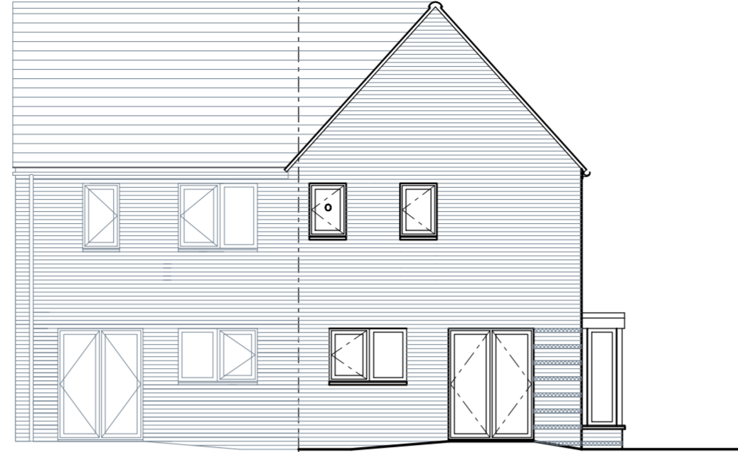
Rear Elevation (1:100)