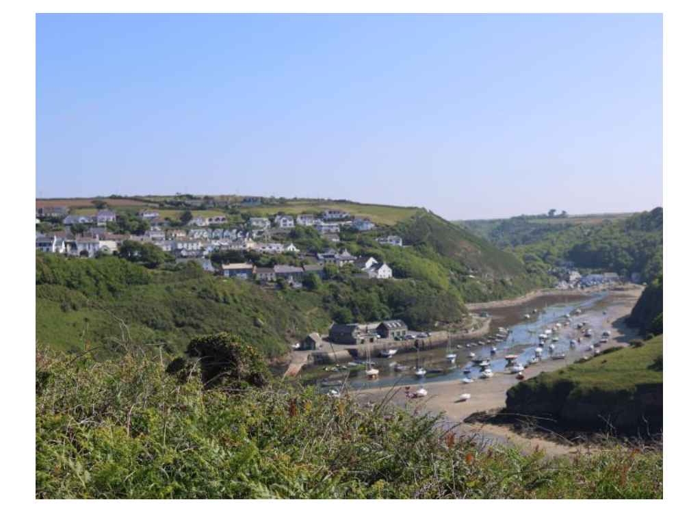
C7 View NE from the Wales Coast Path S of Upper Solva, showing the relationship between Upper Solva and the Solva estuary and valley.

C6 View W from a field gate in the western boundary hedgerow of the minor road between Upper Solva and Whitchurch, N of Ynys Dawel. The open coastal plateau W of Solva is visible in the centre of this view, with a lattice of hedgebanks demarcating the small-medium sized agricultural fields. This location is at around 81m AOD. The western edge of St. David's is only just visible on the western land horizon in the centre right of this view