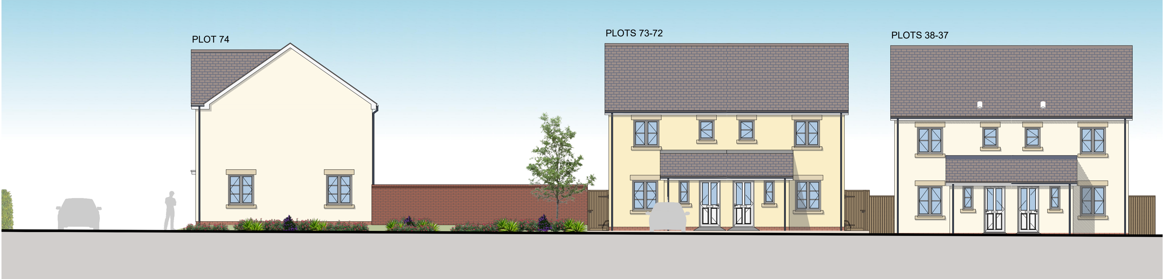
Street Scene A-A