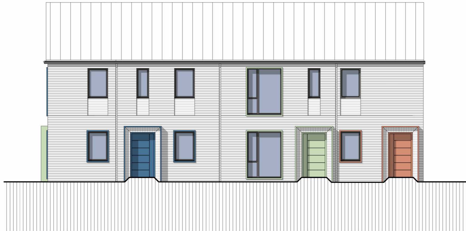
Side Elevation 1 : 100