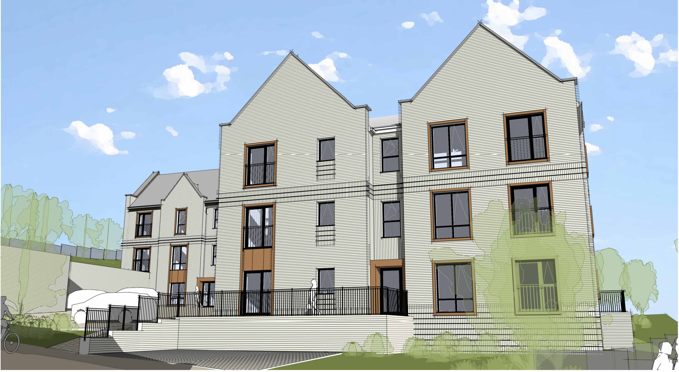
3D View 6