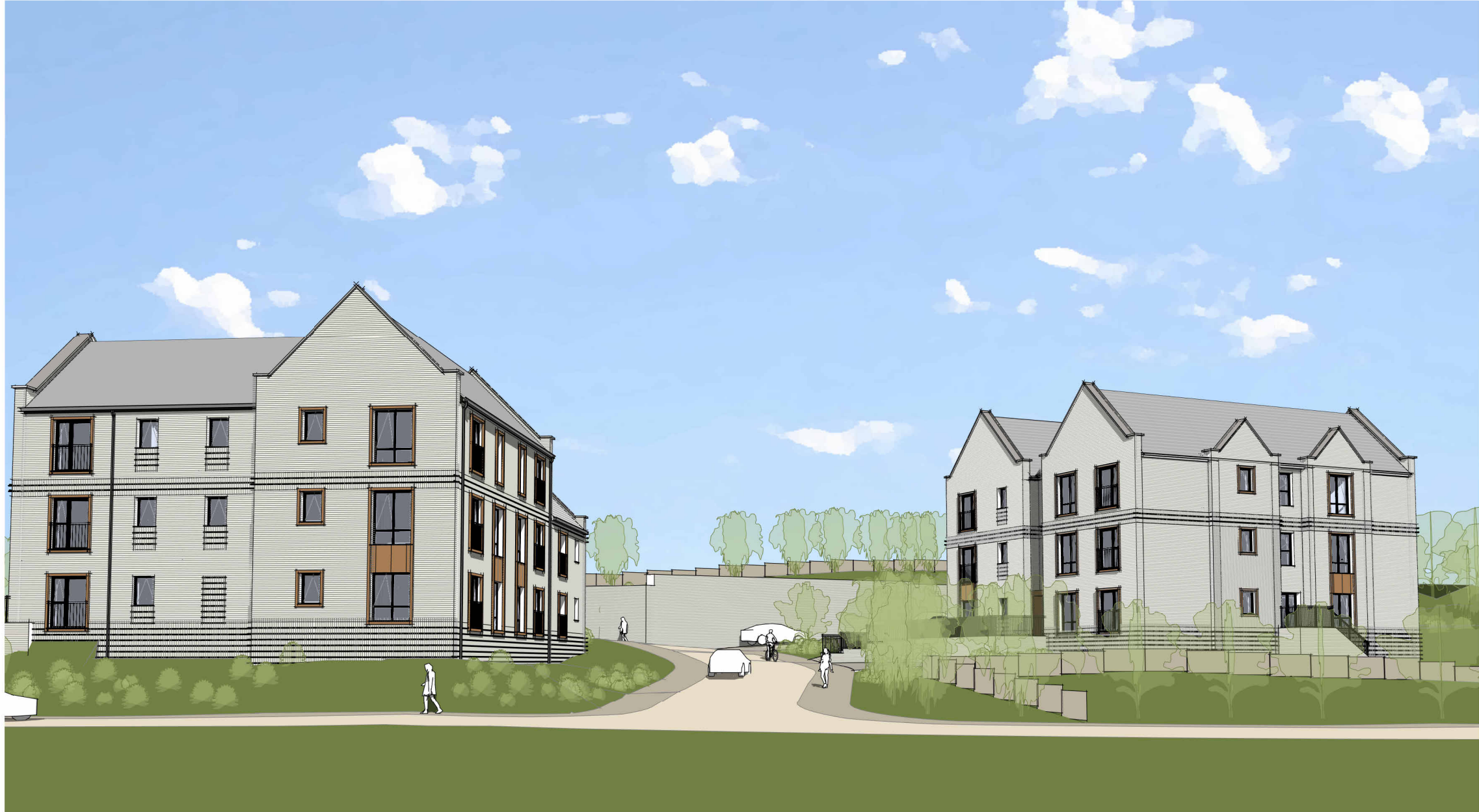
3D View 3