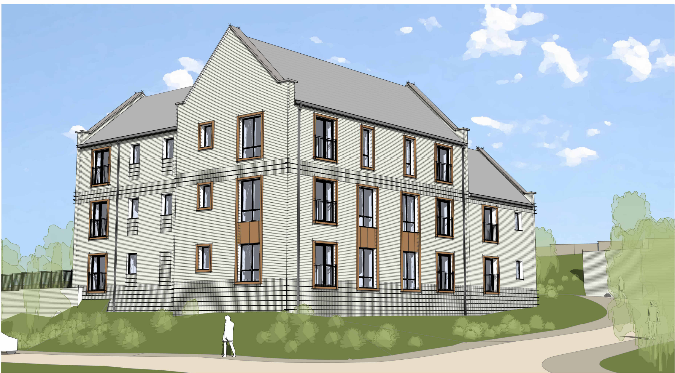
3D View 4