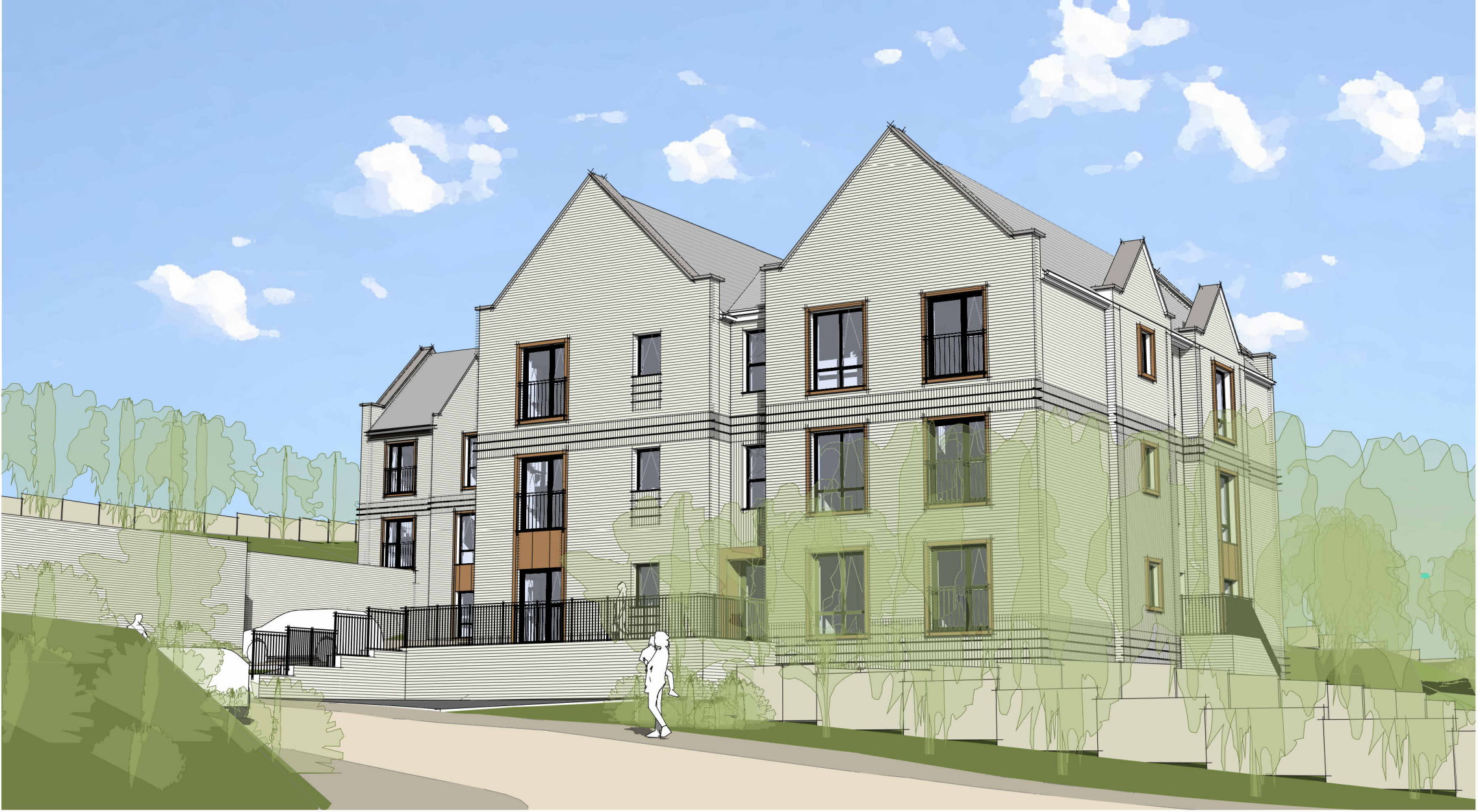
3D View 5