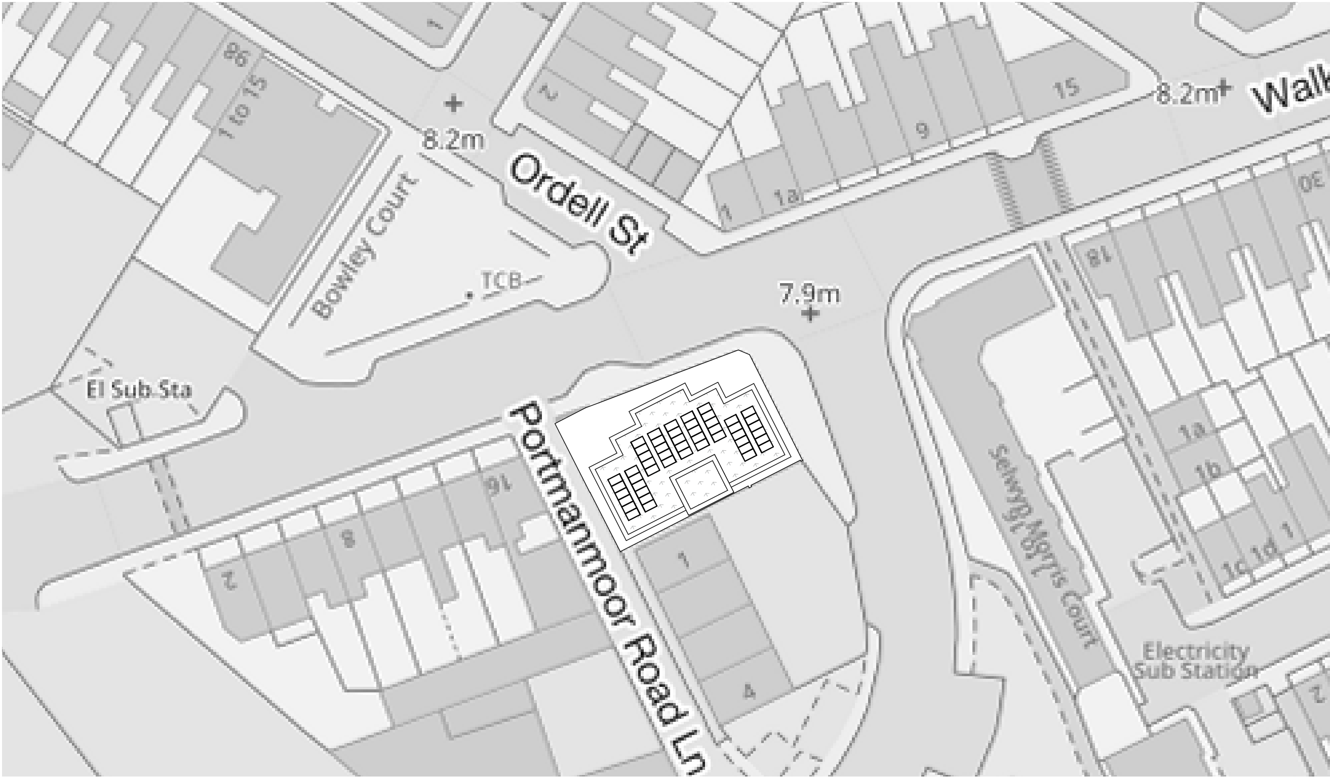
5. Proposed Site Plan 1:500