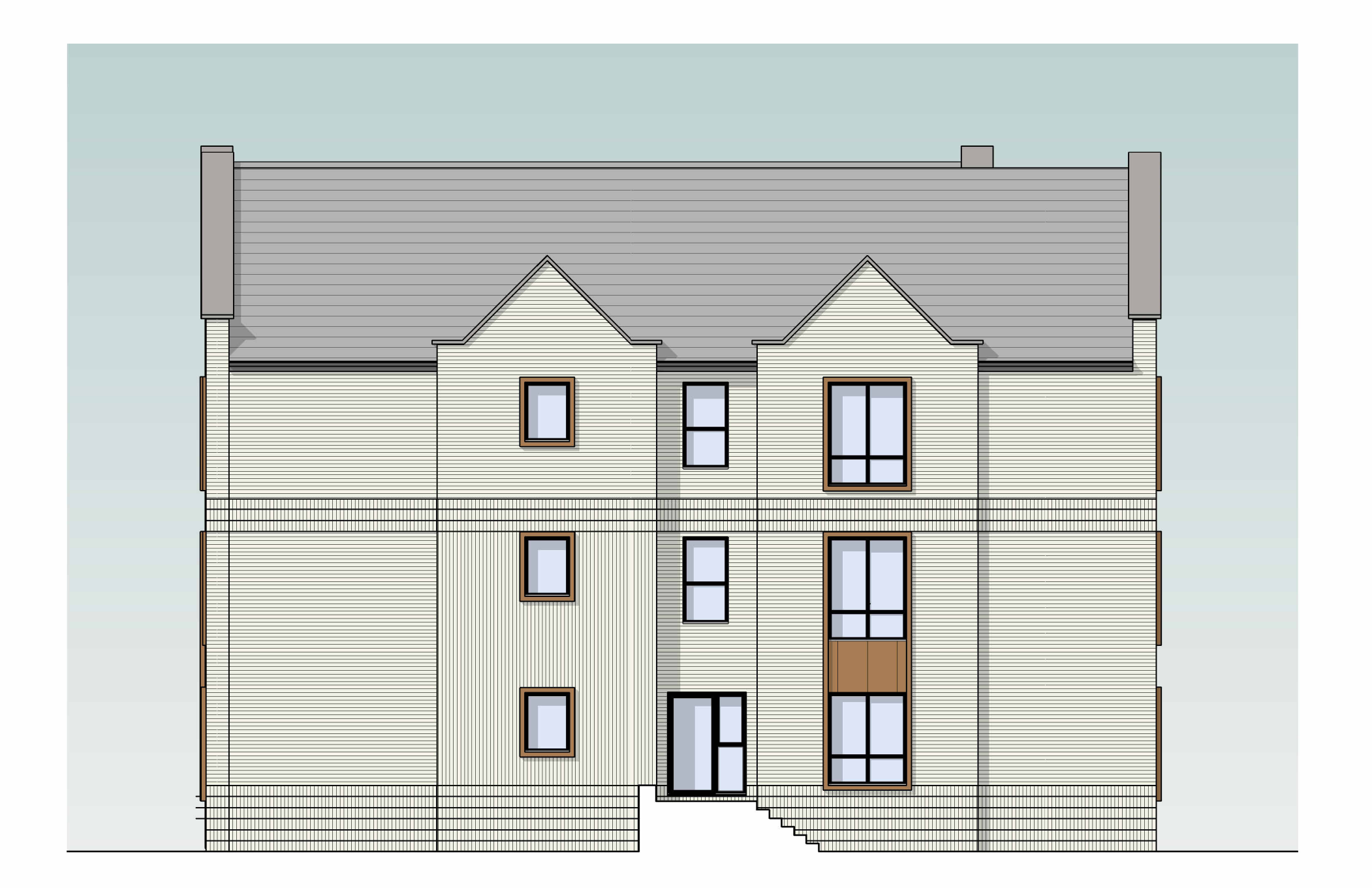
2 Proposed Elevation 02 - East Facing