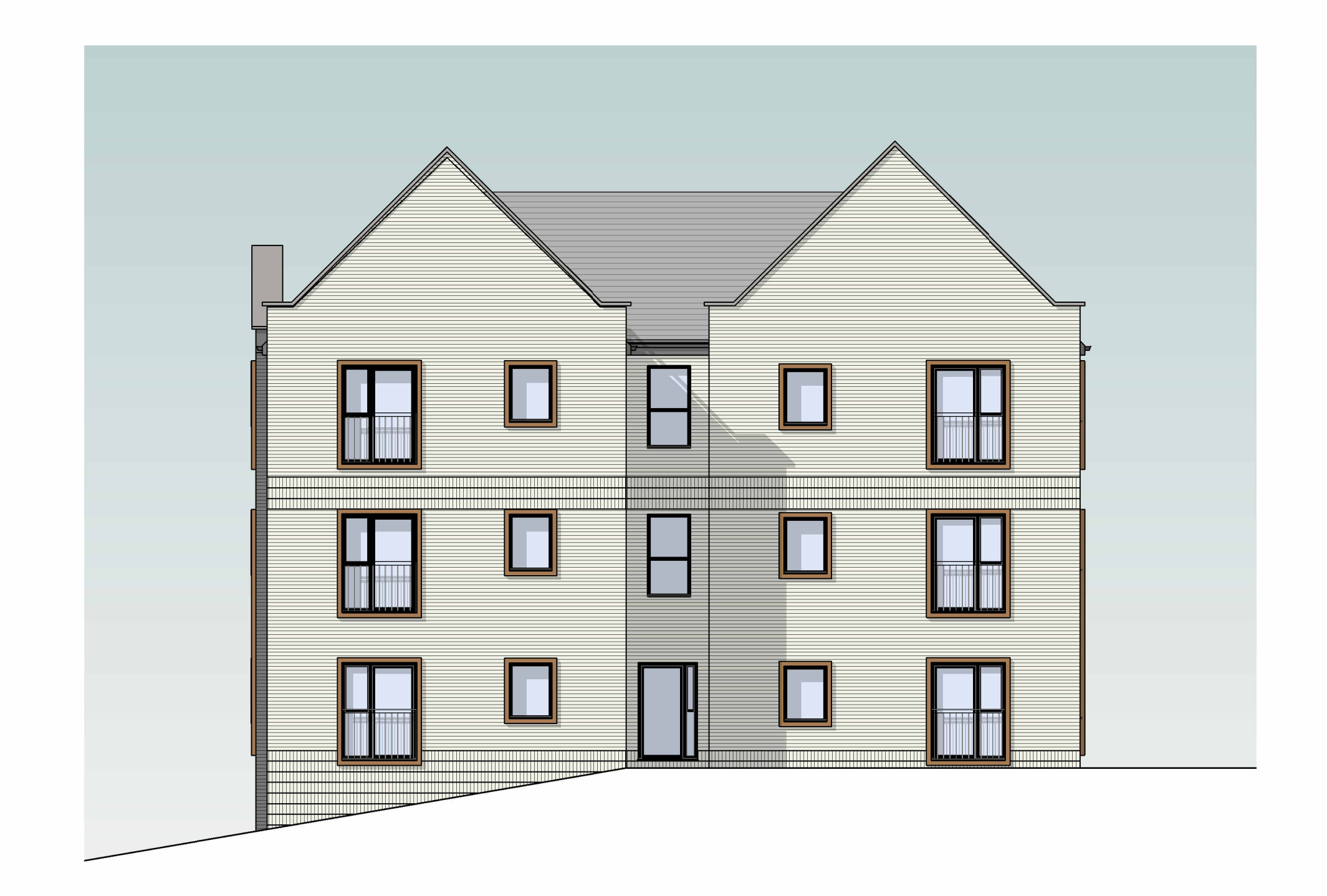
3 Proposed Elevation 03 - North Facing