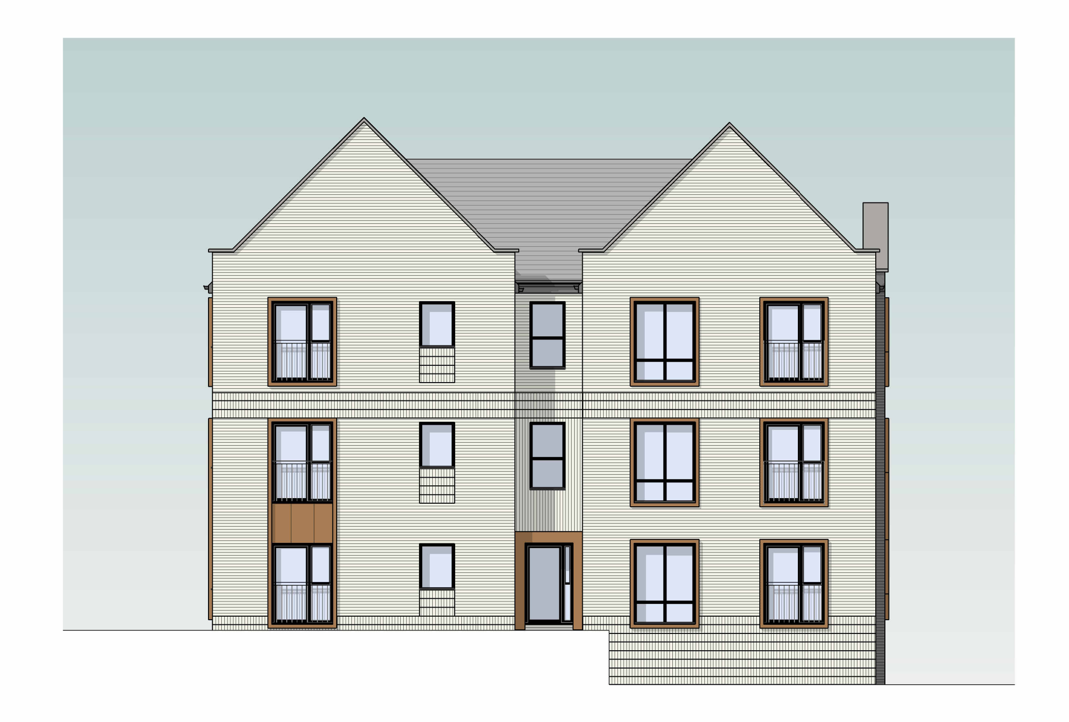
1 Proposed Elevation 01 - South Facing