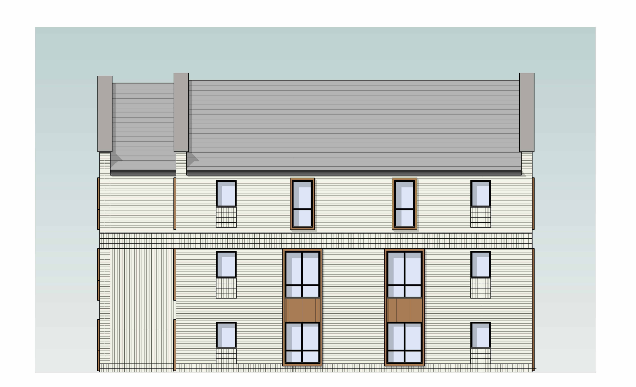
12 Proposed Elevation 04 - West Facing