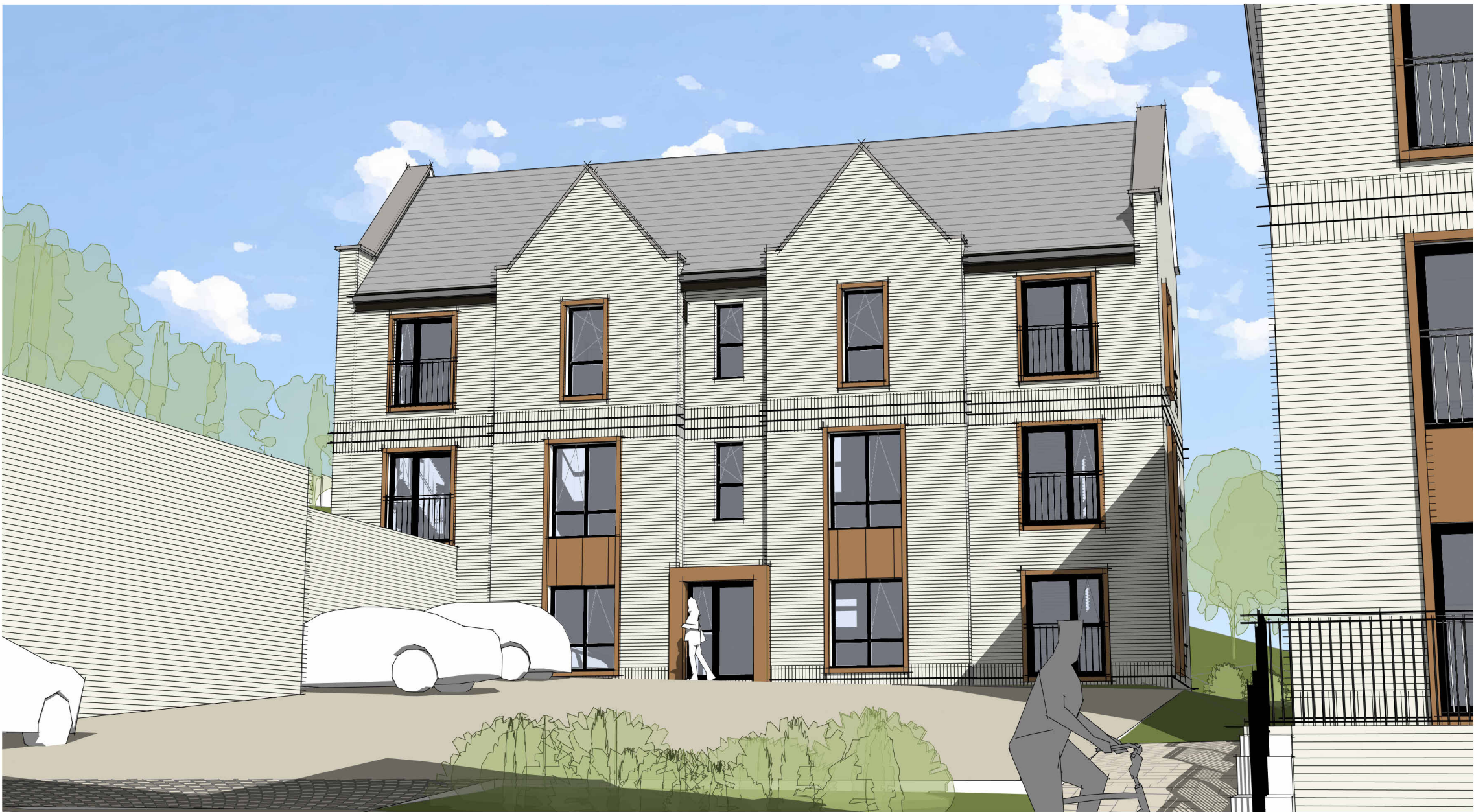
3D View 7