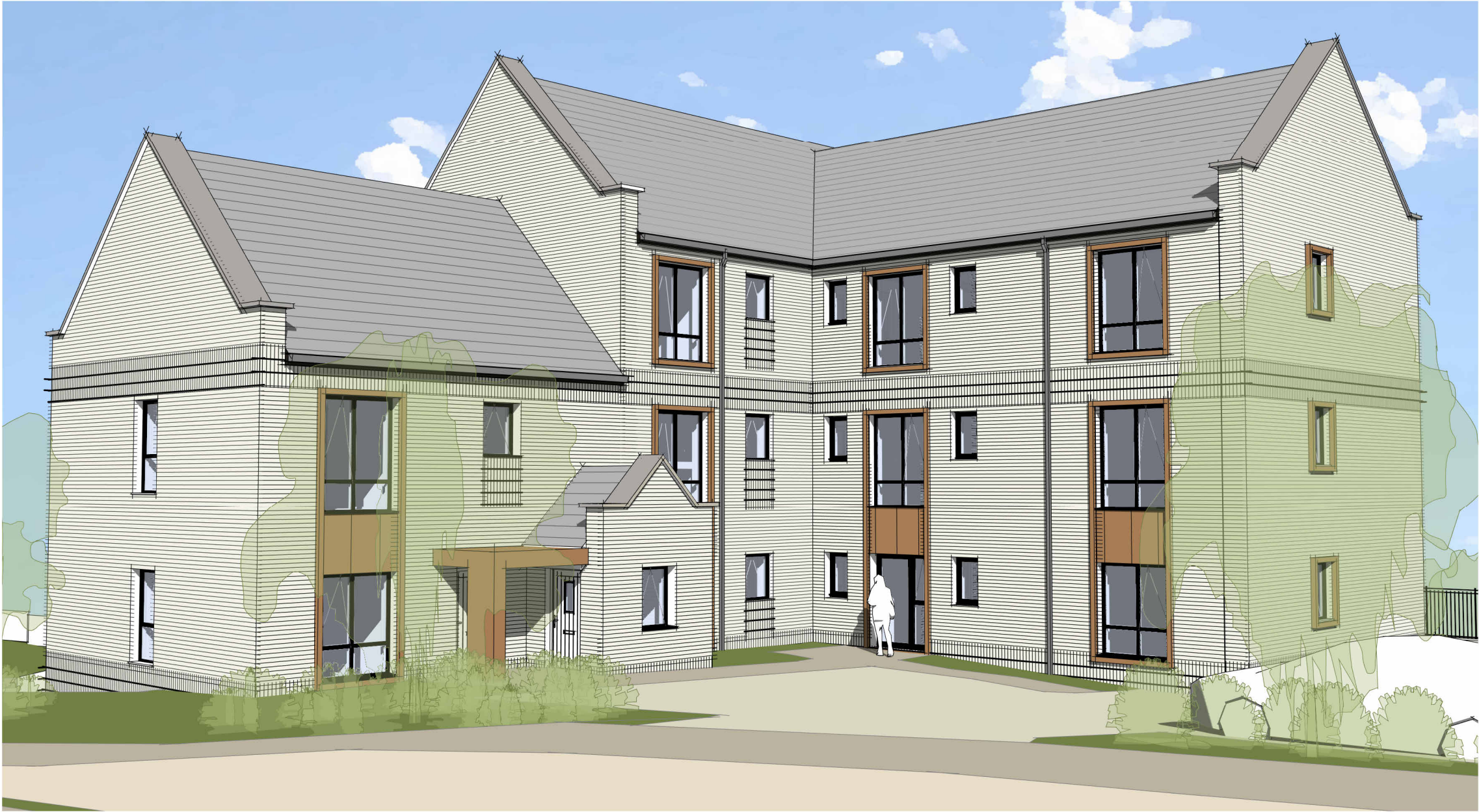
3D View 8