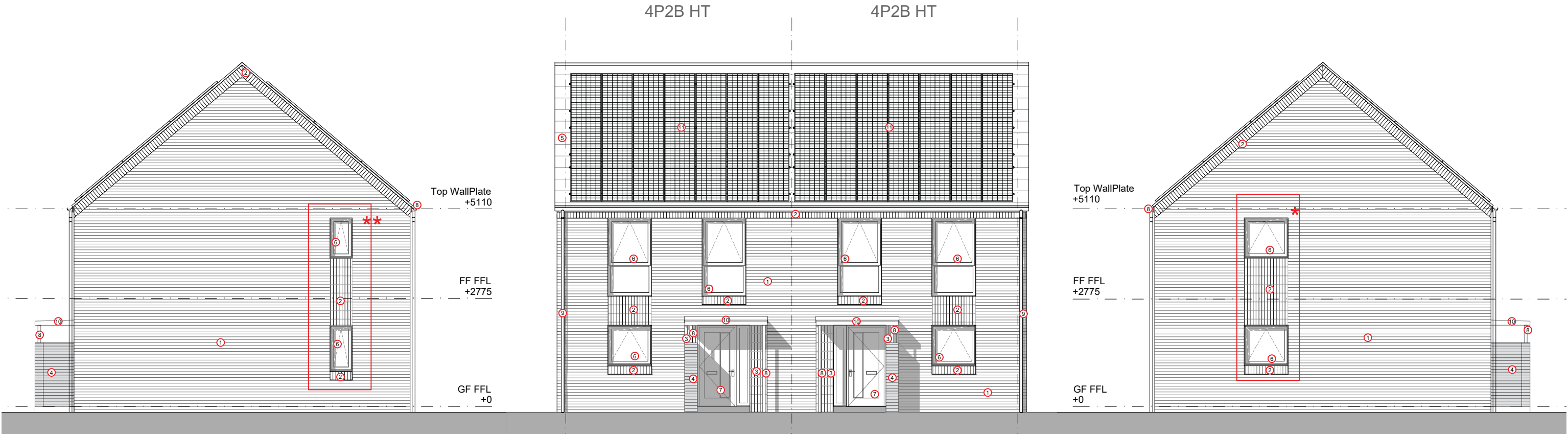
SIDE ELEVATION (R)