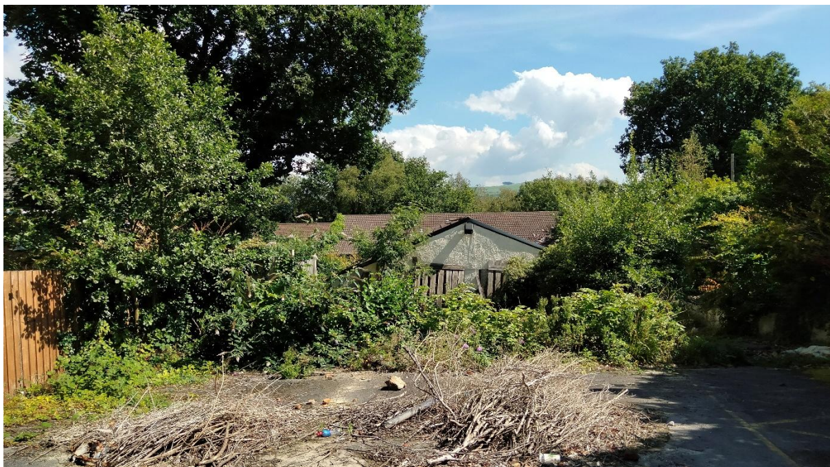
View southeast showing existing building, overgrown vegetation and existing boundary trees.

The site will be enhanced by the introduction of new native tree planting, native hedge planting, new shrubs including plants known to benefit wildlife, wildflower meadow areas and other habitat types.