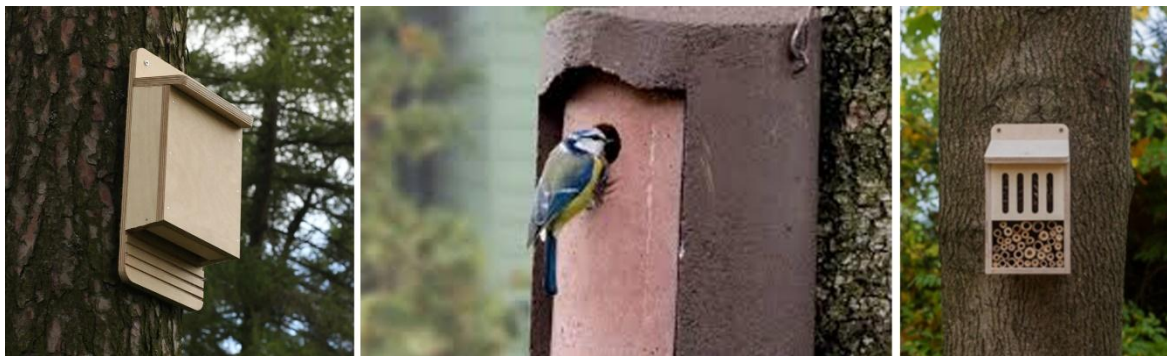
Bat boxes, bird boxes and invertebrate refugia.

In addition to the habitats created through the planting design, the site will also include other ecological measures. Bat and bird boxes will be installed on the new building.