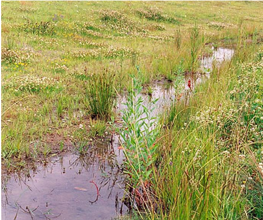
'RE3 River Floodplain - Water Meadow' by Germinal Seeds or similar.

This gives us an excellent opportunity at surface level to create rich wetland and grassland habitats capable of holding water on site. This will improve and manage water quality, enhance biodiversity as well as providing amenity for the people using the site.