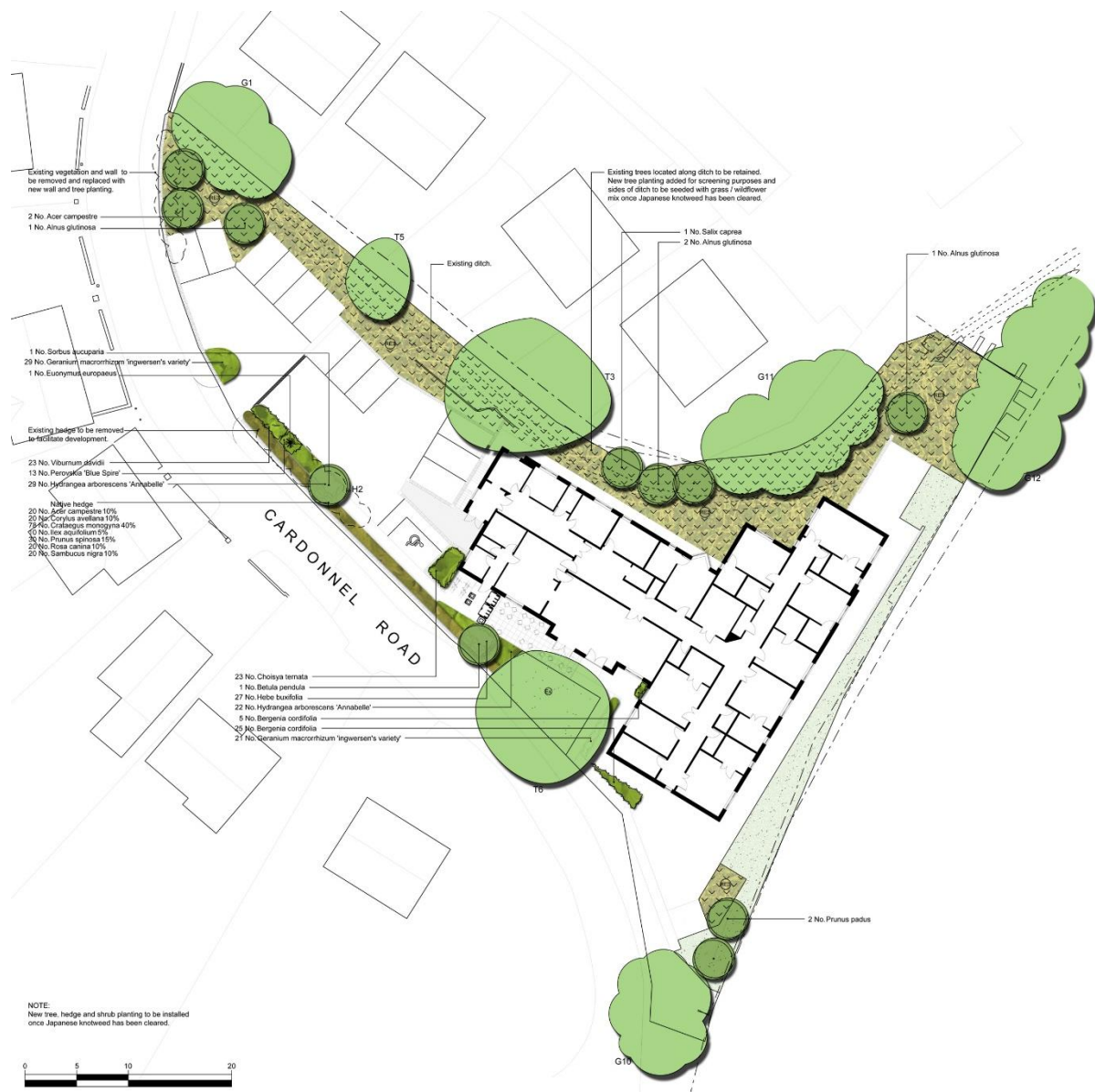
Figure 02 - Extract from DPLA drawing 1191.01

An extract of the soft landscape proposals drawing is copied below and clearly describes the design intent for the planting areas.