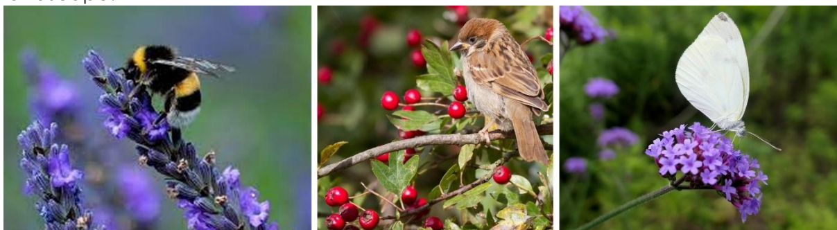
Landscape features to benefit people and wildlife.

The combination of the above measures will enhance biodiversity across the site and demonstrates every effort is being made to create a multi-functional landscape.