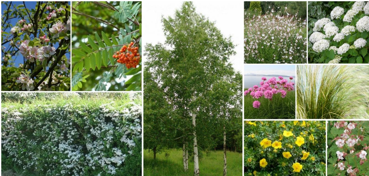
Native trees, hedges and shrubs known to benefit wildlife.

The combined effect of the above measures will be the creation of a species rich landscape, appropriate to the scale and nature of the proposed development.