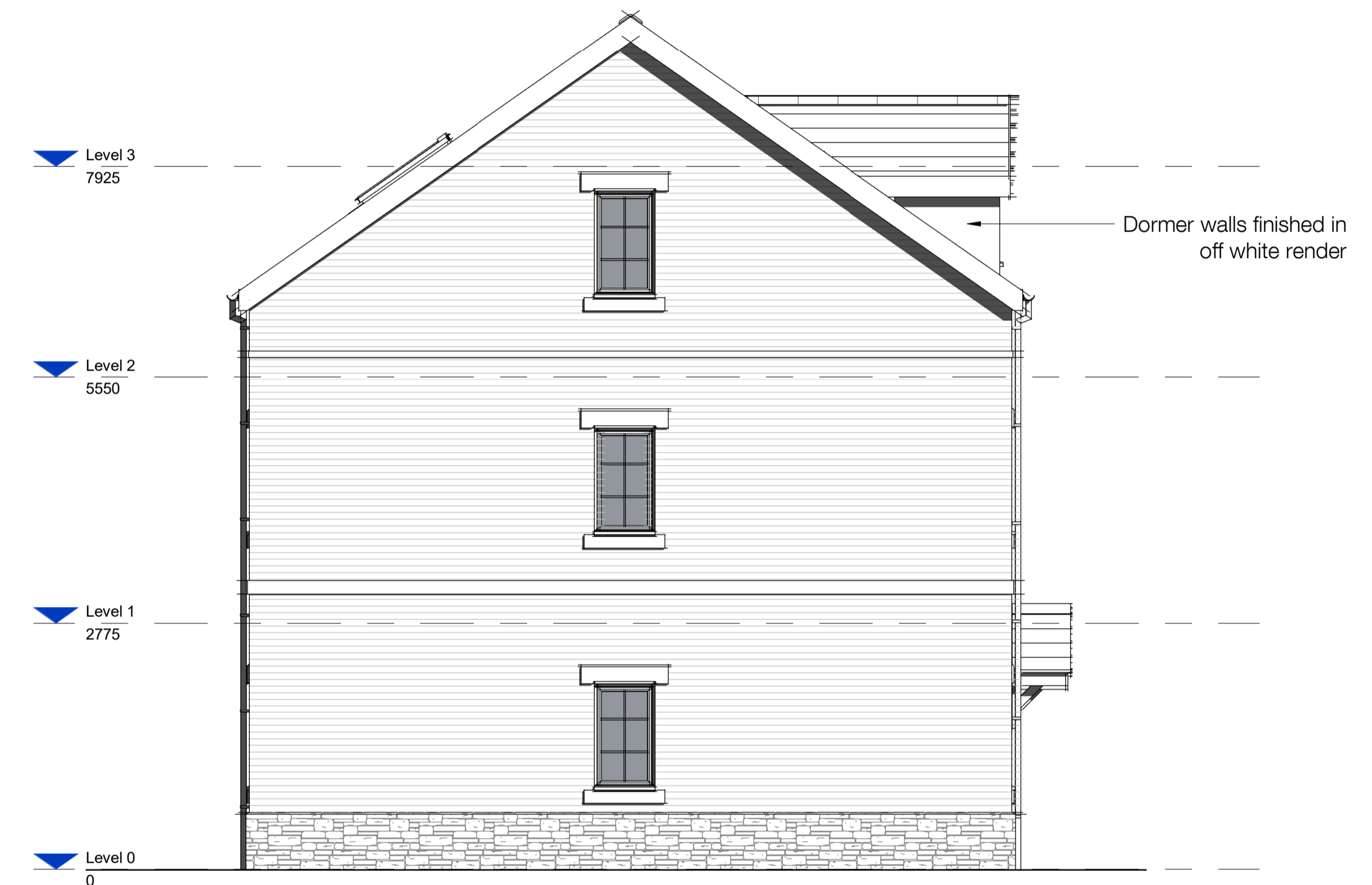
Side elevation 2 (Block 1 & 2)