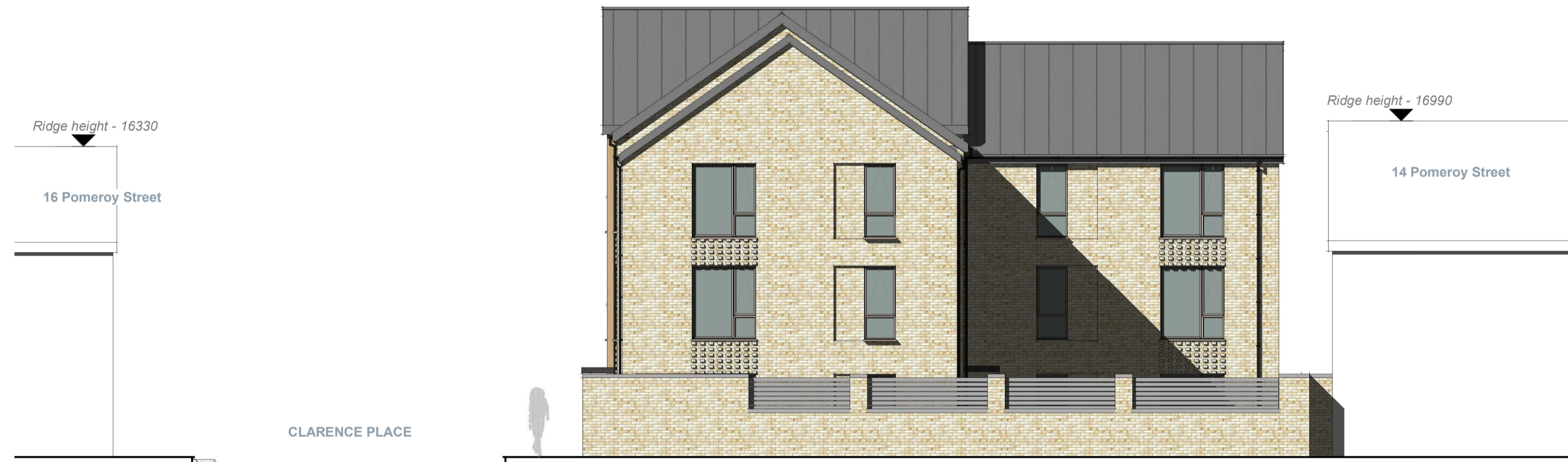
01 Elevation 3 - a 1 : 100

Notes: Do not scale this drawing. Check all dimensions on site. Any discrepancies to be reported back to the Architect for clarity.