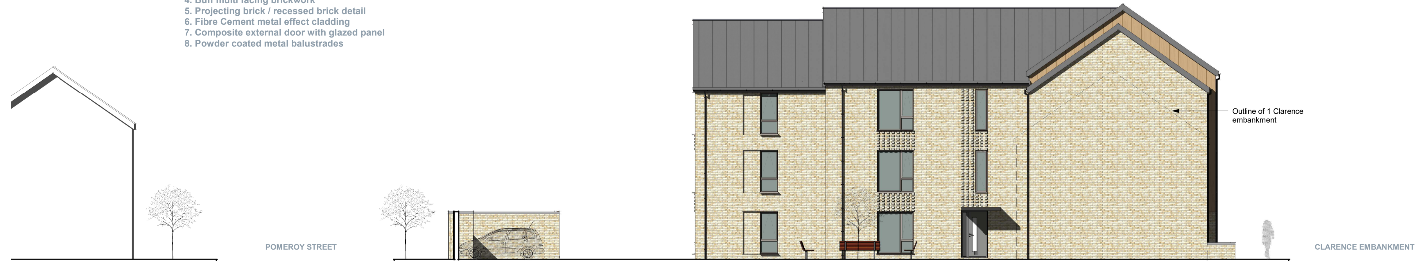
02 Elevation 4 - a 1 : 100