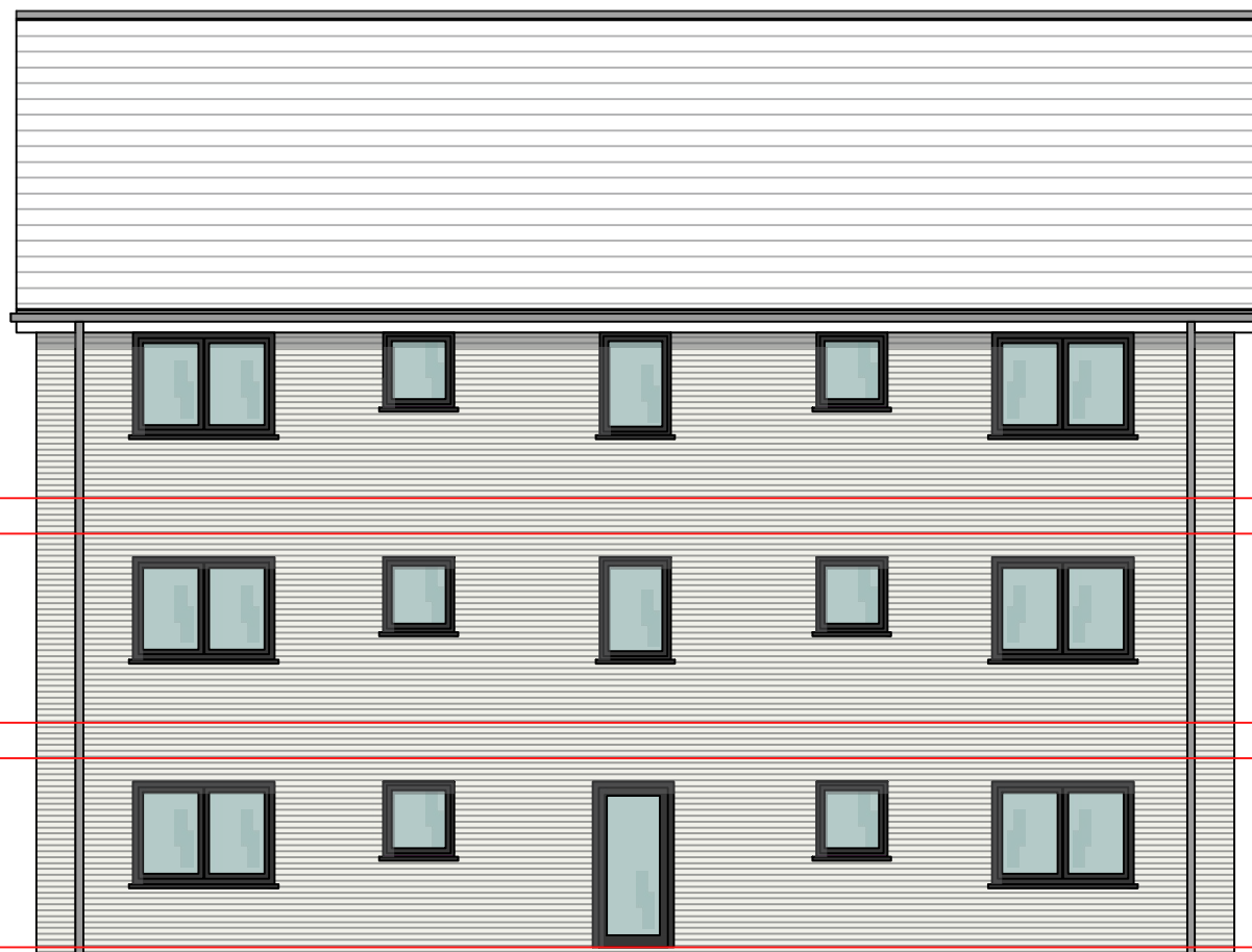
BUILDING TYPE B: REAR ELEVATION