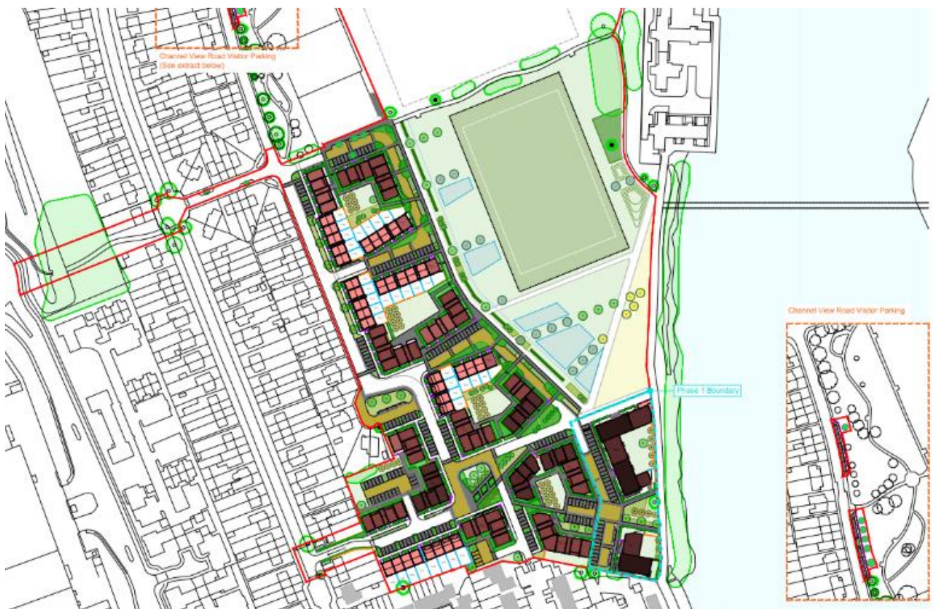
Figure 2 – Proposed Masterplan (Powell Dobson Architect)