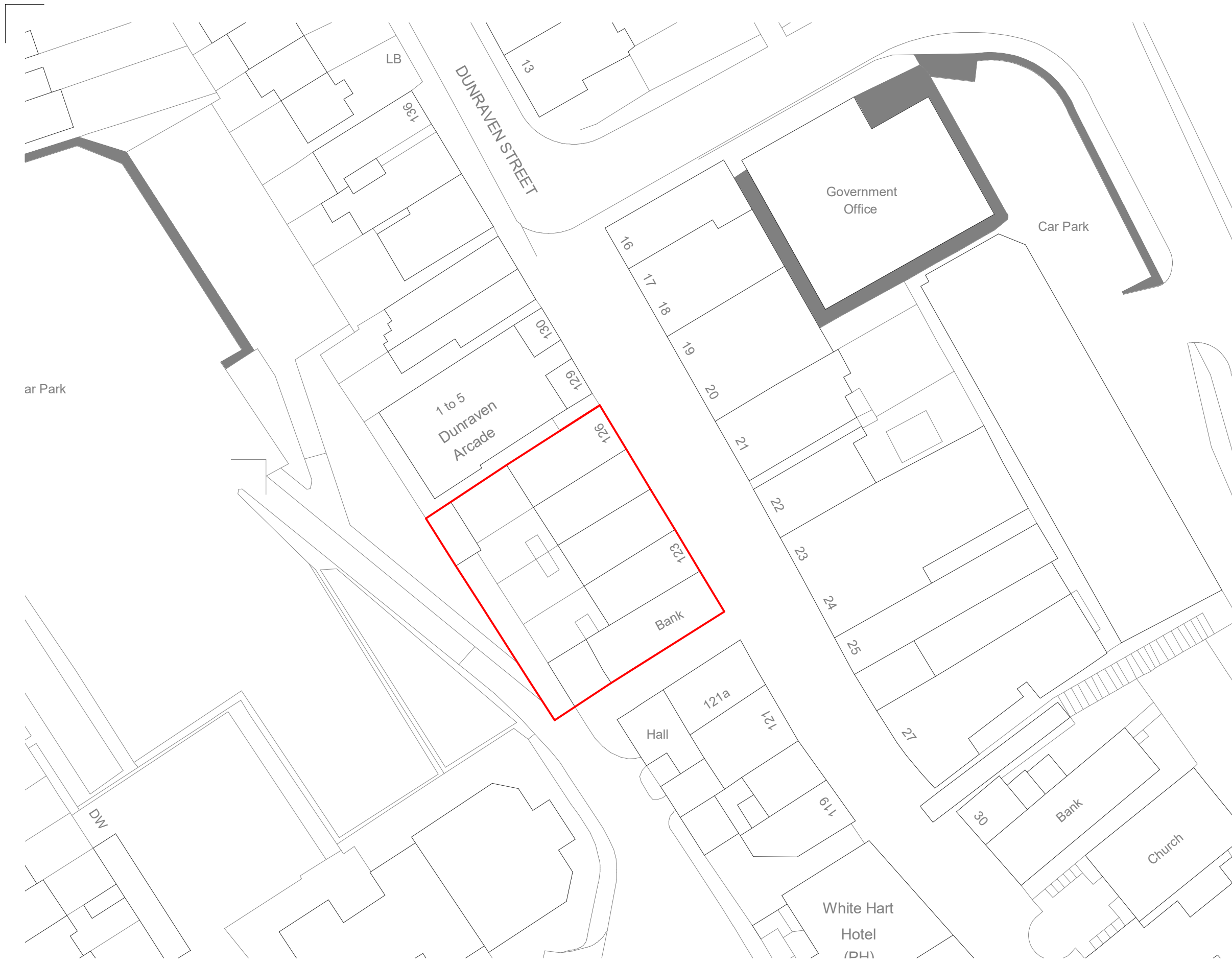
Existing Site Plan 1 : 500