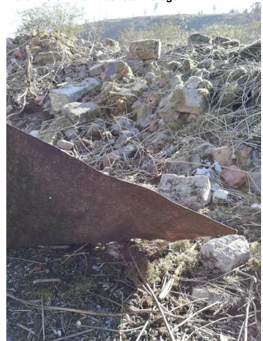
Plate 1: Slow-worm beneath refuge