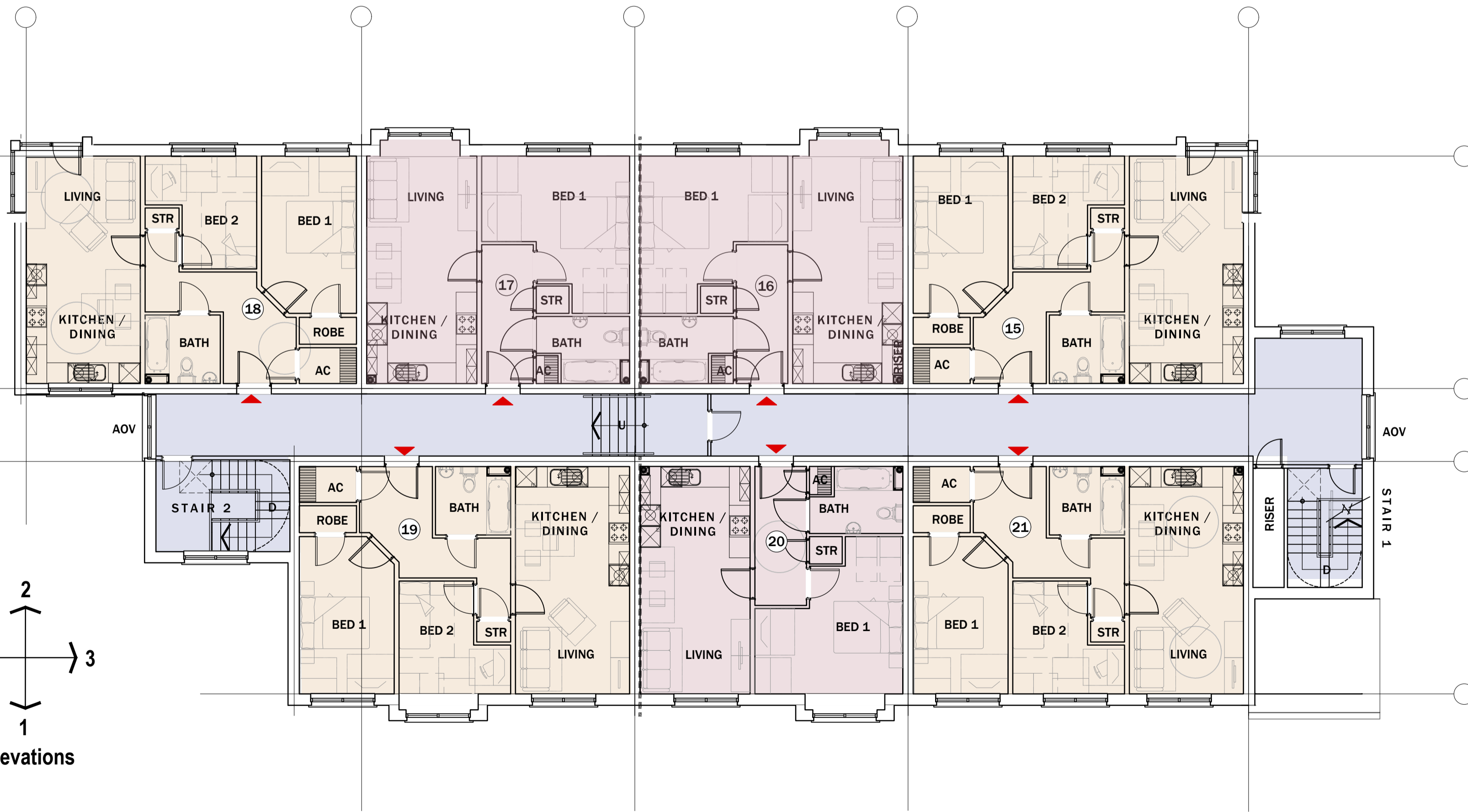
SECOND FLOOR PLAN BLOCK 1