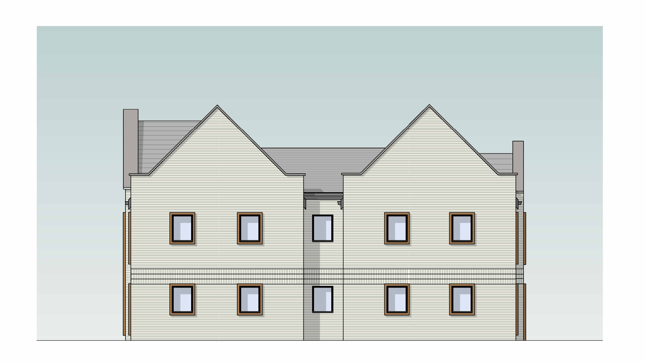
4 Proposed Elevation 04 - Facing West