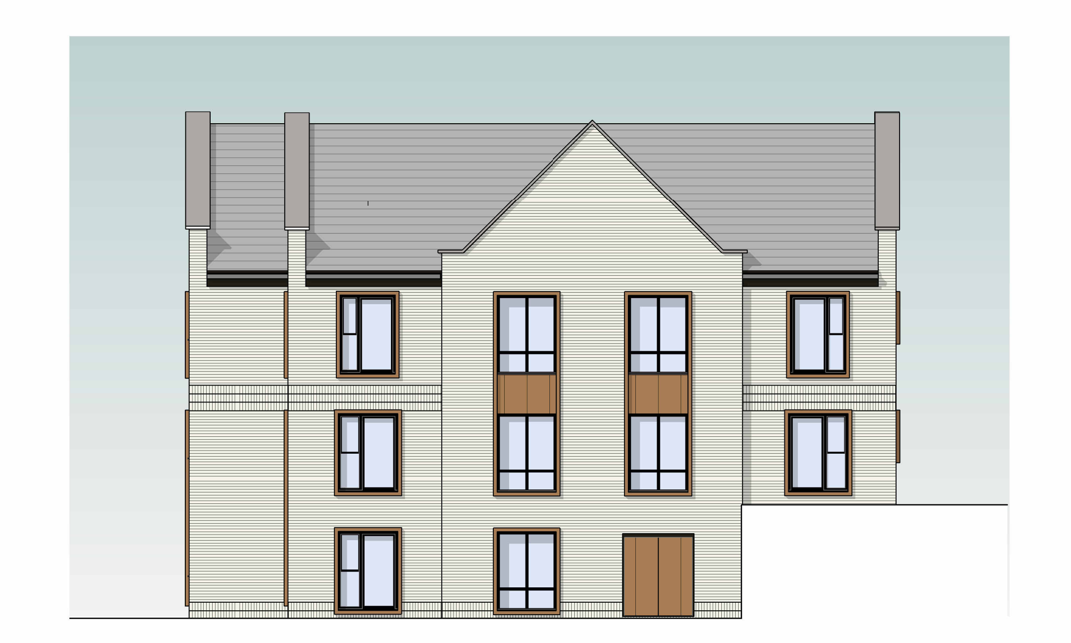
3 Proposed Elevation 03 - Facing North