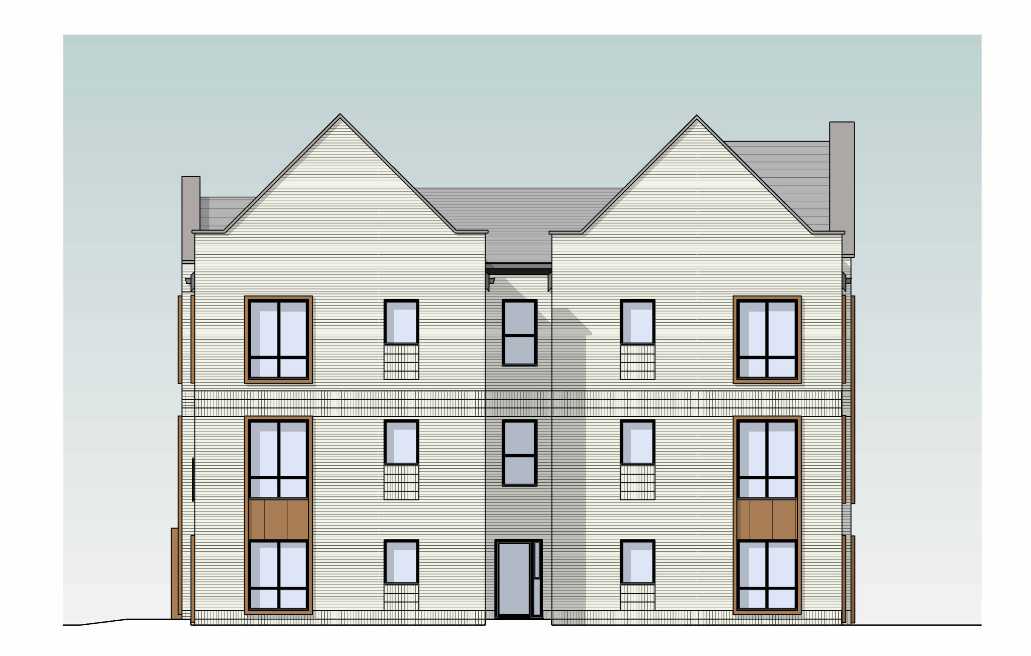
2 Proposed Elevation 02 - Facing East