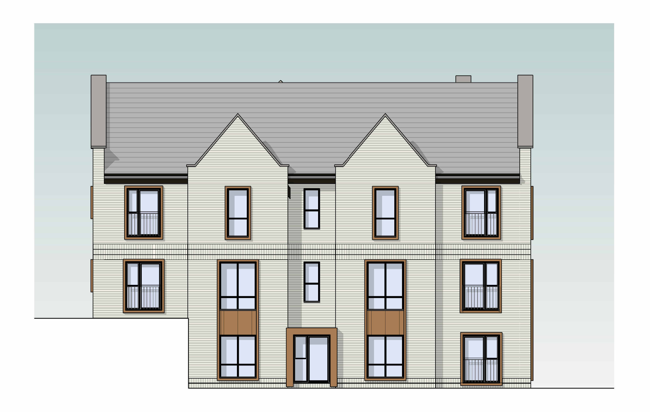
1 Proposed Elevation 01 - Facing South