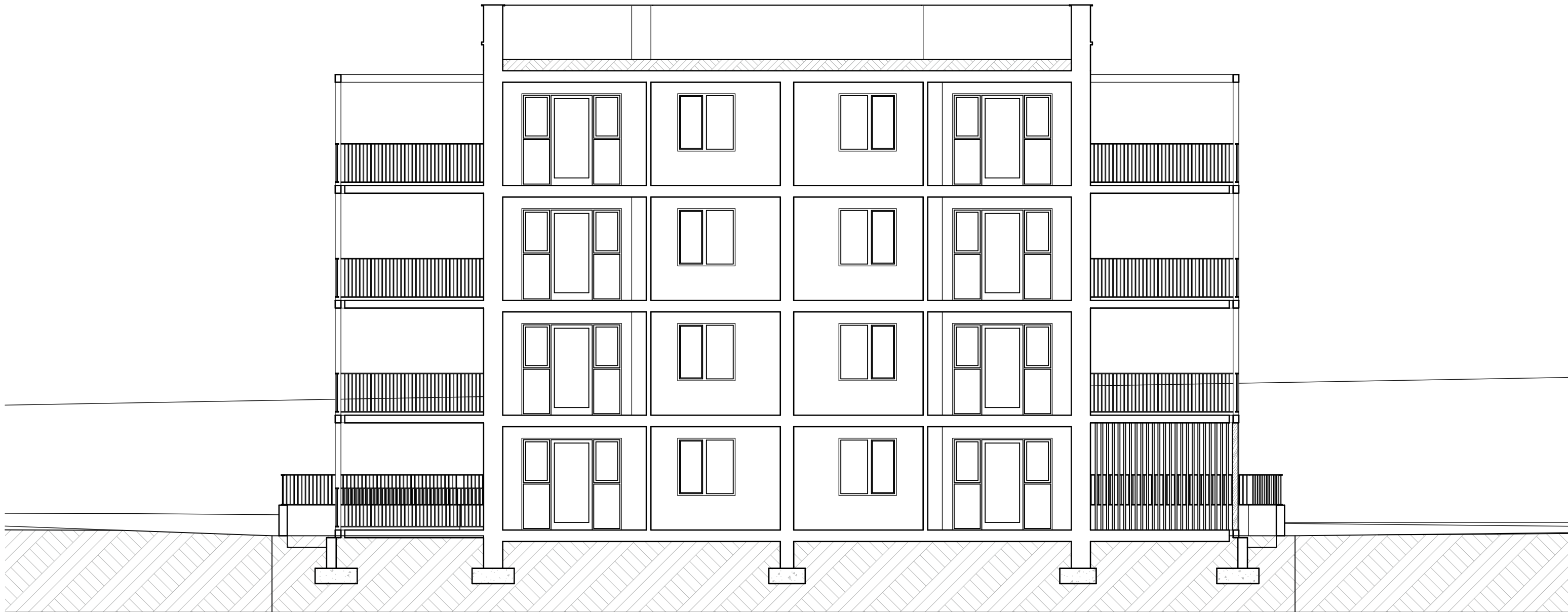
S-03 Building Section 1:100