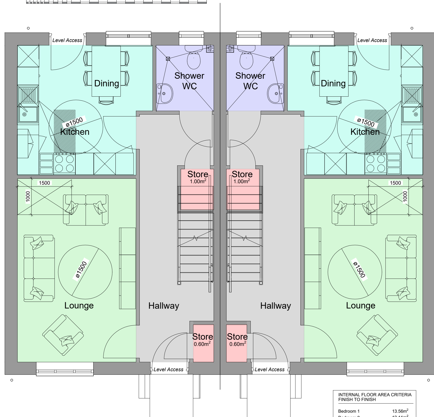
Ground Floor Plan 1:50