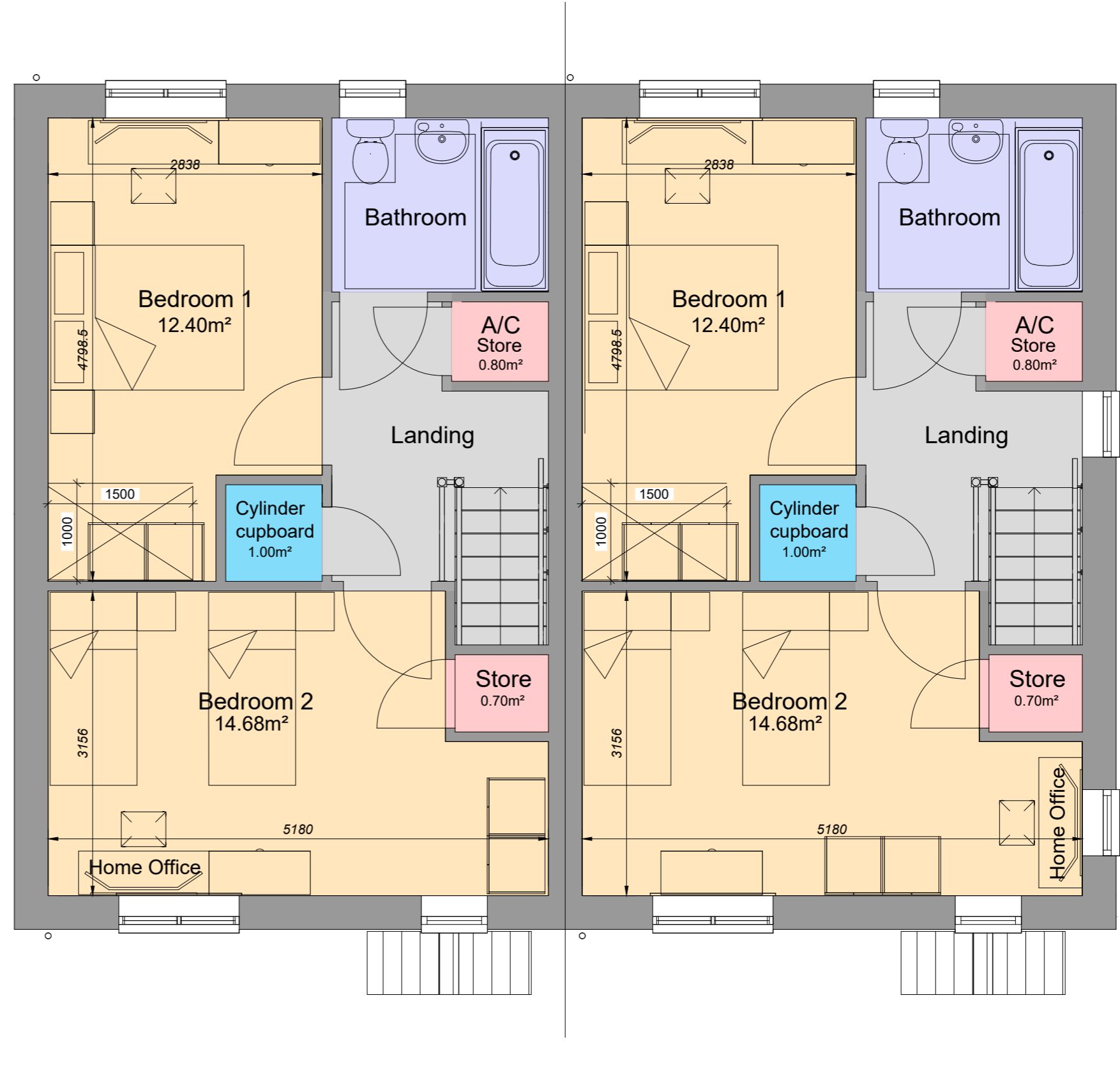
First Floor Plan 1:50