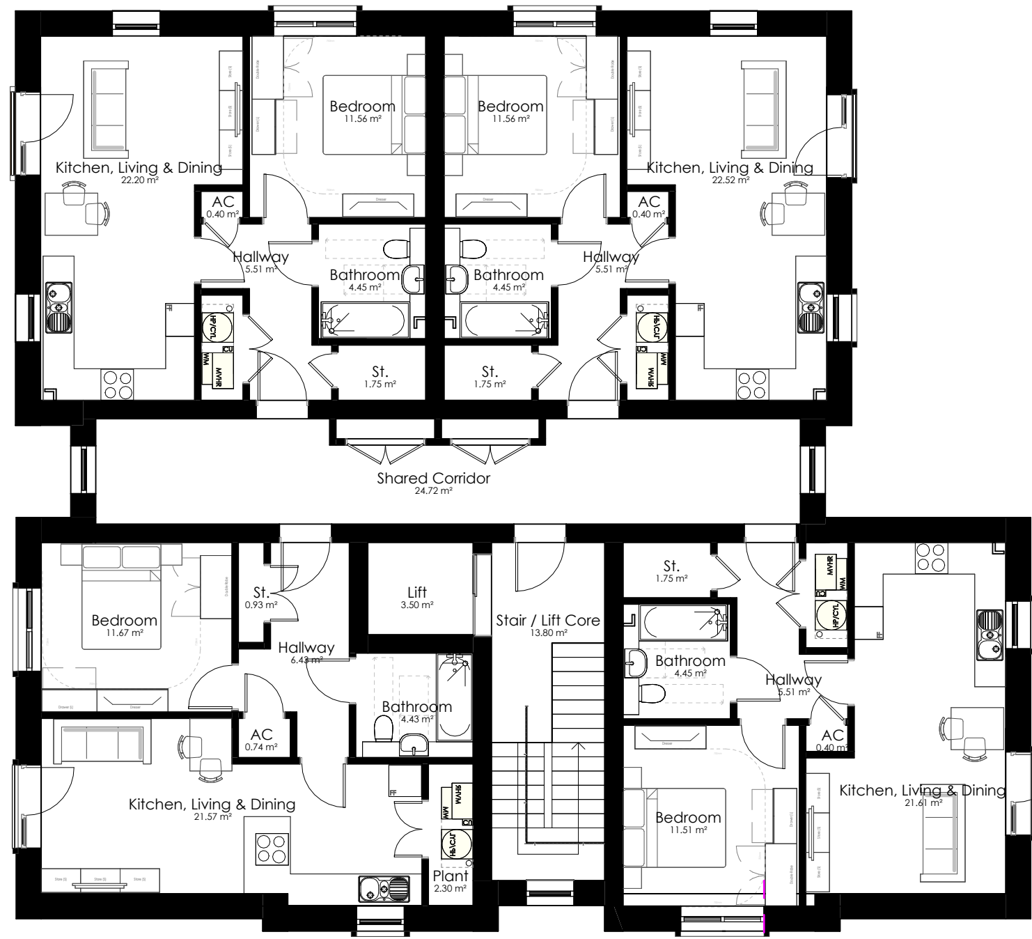
2 First Floor Plan Scale: 1 : 100

Proposed Elevation 02 - East Facing BB(03)300 Ref. dwg