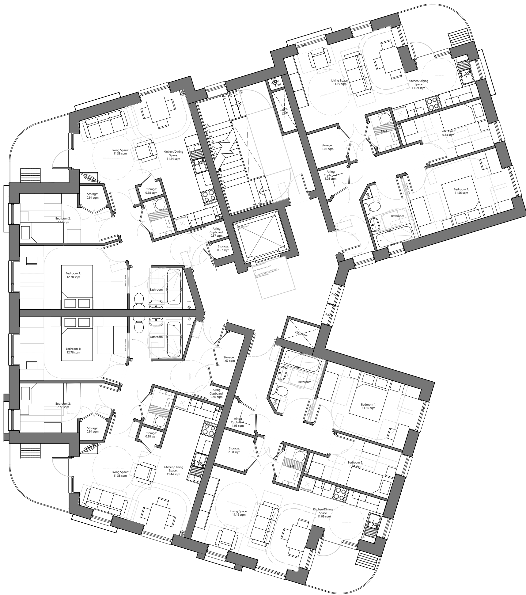
First Floor - General Needs 3P2B Apartments GIA: