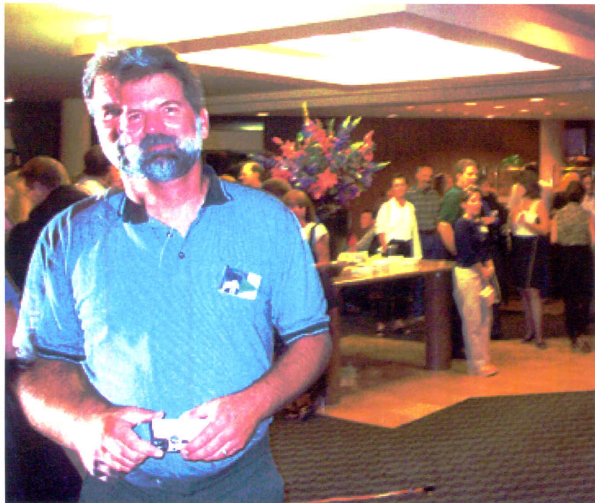
Quinn was absolutely beside himself. Bets were heavy on a splitting headache in the morning.