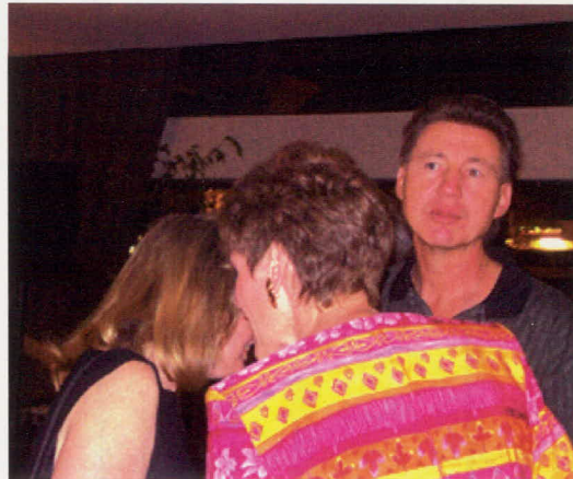
"They're always talkin' about me and I wish I knew what they were saying!"