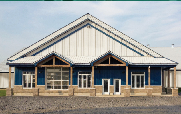
AGRICULTURAL & INTERIOR LINERS