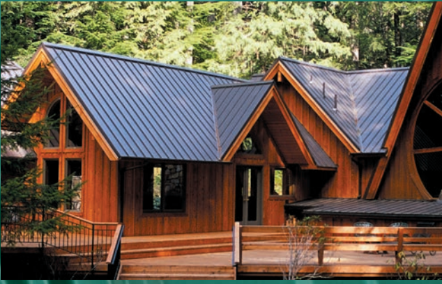
RESIDENTIAL & COTTAGES