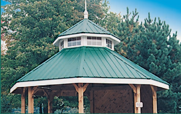
COMMERCIAL & LIGHT INDUSTRIAL