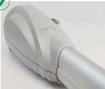
Motor case in painted Aluminium