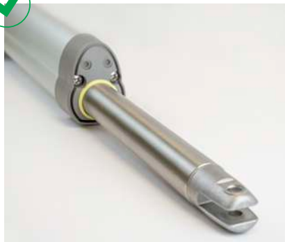
Robust rod in stainless steel.