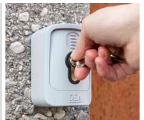
GT-KEY key selector