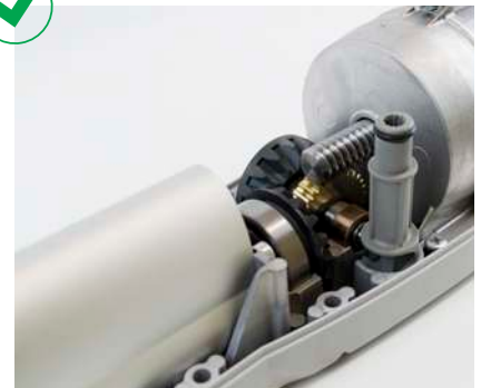
Internal mechanics in steel with ball bearings