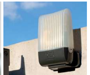
AURA flashing light