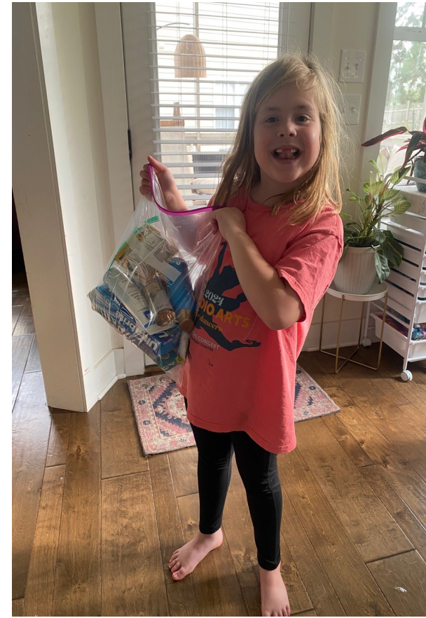
More proud assistants!