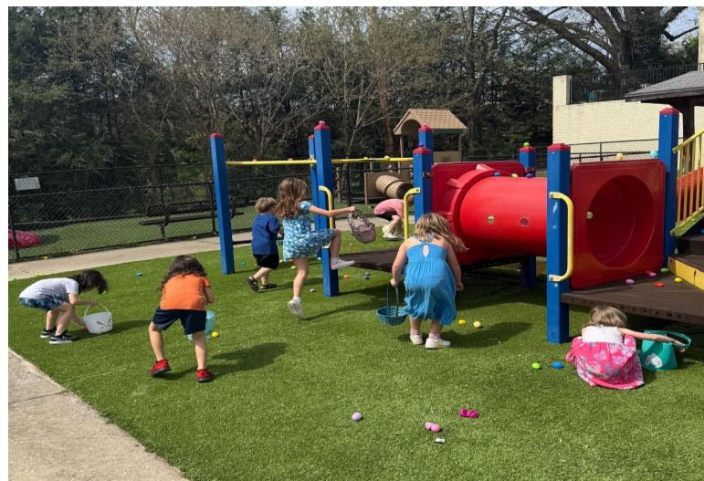
“Scrambling” for Easter eggs!