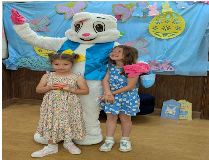
Easter Bunny and friends!

Asbury's Annual Easter Egg continued its tradition of being a fun-filled event for Asbury children past and present, our ACEC children, members young and old, and children in the community! Besides lunch and an egg hunt, other activities included a cake walk, a tattoo station, a craft station, cookie decorating, bunny bowling, golf, carrot ring toss, guessing numbers of objects in a jar, word searches, and of course pictures with the Easter Bunny! Thank you to everyone who donated candy, plastic eggs, food and drink items, your time, and your good thoughts and prayers. It was heartwarming to have our adult children who participated as children, bring their young children back to Asbury for the celebration and egg hunt. It is truly a tradition and an event that continues to contribute to 150 years of service!