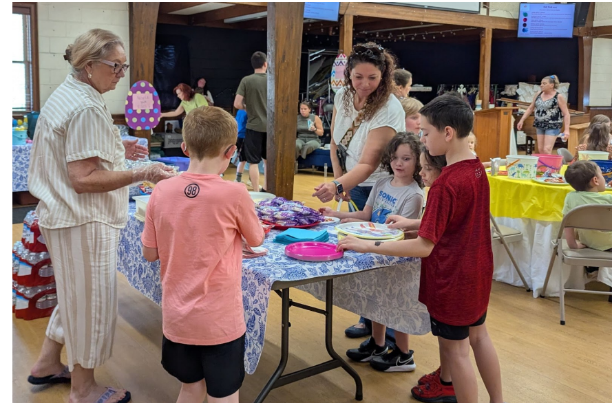
Enjoying Easter activities!