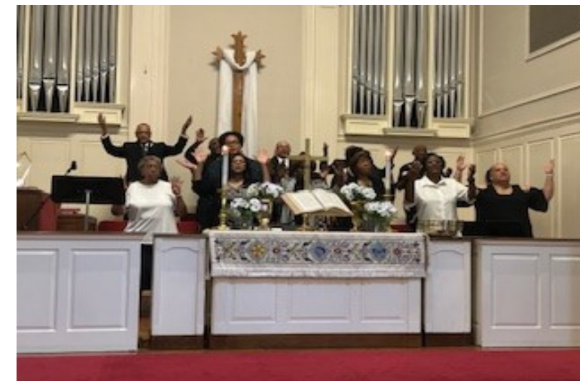
Friendship Baptist Church Choir

On Sunday, May 18th a historic event occurred! The congregations of Friendship Baptist Church and Asbury United Methodist Church came together to worship as one family! This joint service was such a blessing!