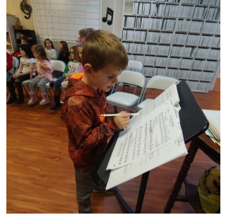
Future Choir Director