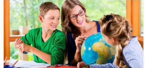
How I homeschool