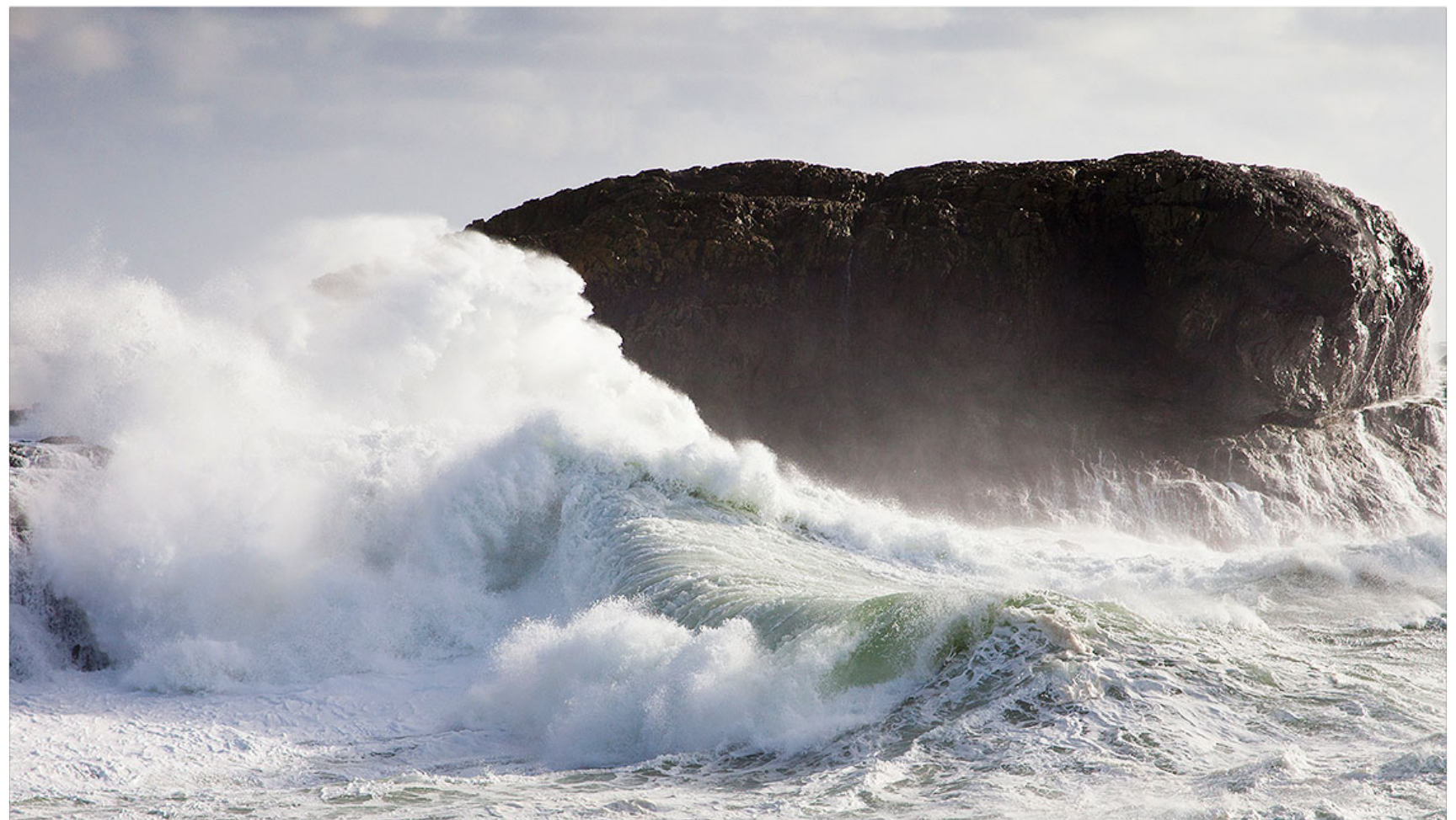
Tofino BC - rolling waves on outer west coast.

ROCK of our FAITH, the ROCK on which we stand. Our faith is to be built up and rooted in our Lord and Saviour with such strength that we are immovable from His side. The Lord speaks of this in Matthew 7 and the wise man that builds his house on the rock (on His words and on His promises) and the winds and waves can't wash it away.