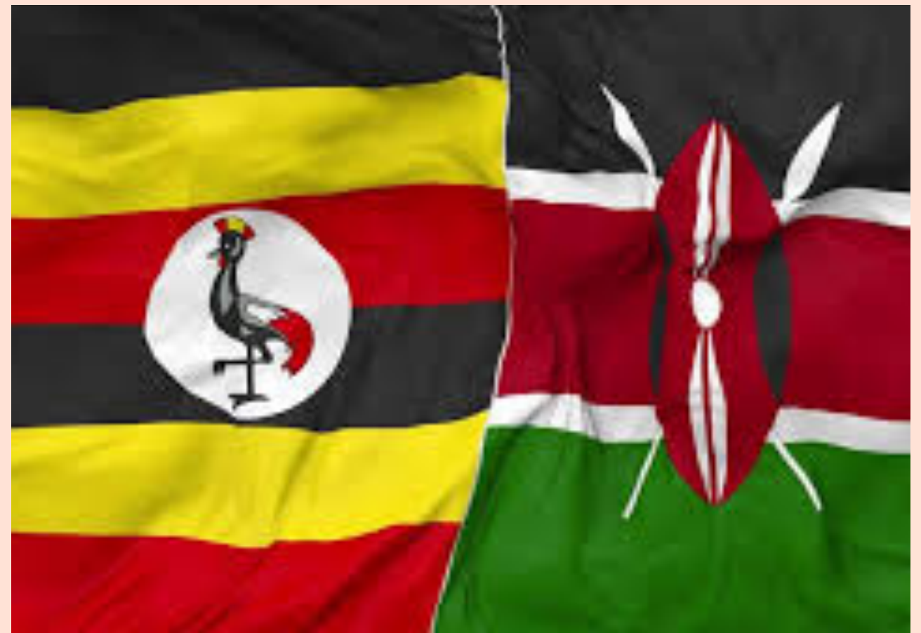
Kenya & Uganda Location of COSF